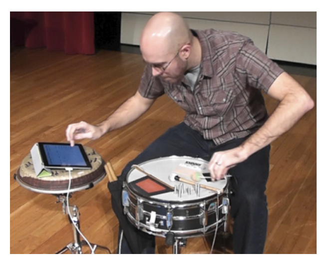
Figure 3. Prepared snare drum and iPad positioned for performance. Visual interface on laptop computer screen (cropped out of picture) is centered below and in front.

including the effect level and delay time. If the performer changes the delay time, after several seconds, it will gradually sweep back to the default delay time, which eases the workload of the performer and facilitates the utilization of accelerating and decelerating rhythmic effects. Although these audio signal processing algorithms are relatively simple, but quite flexible, the performer can predictably combine multiple iPad control gestures with various percussive gestures on the prepared snare drum to synthesize a great variety of both static and transitioning timbres, ranging from acoustic to electronic, pitched to indefinitely pitched, metallic to wooden, and inharmonic to harmonic spectra.