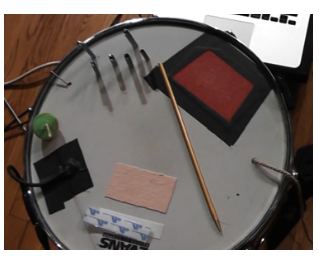
Figure 1. Overhead view of the prepared snare drum.

through the drumhead are struck to create a quick, "ping-pong ball bouncing" effect. A trapezoidal piece of sandpaper is taped onto the drum, which is scratched with the hand or a knitting needle to create a granular, white noise sound. One side of a pair of Velcro strips is glued to the drumhead. When the free side is slowly pulled away from the other fixed one, a light popping sound is created, or a louder hissing sound when pulled quickly. A small chain is looped through the head and drum shell to create an "infinite growl" sound. An attached rope is pulled on with the fingernails for a dark, rubbing sound. A rectangular section of attached moleskin enables muted sounds when tapped or scraped. Also, a small rubber ball that has been cut in half and attached to a wooden skewer is used to create a nontraditional "lion's roar" effect. It can also create muted whale-like sounds.