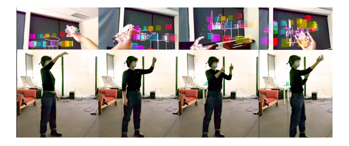
Figure 1: A musician applying freehand gestures to perform with an augmented reality musical instrument. Our study aims to understand musical experiences that are possible with this type of interface.

NIME'23, 31 May-2 June, 2023, Mexico City, Mexico.