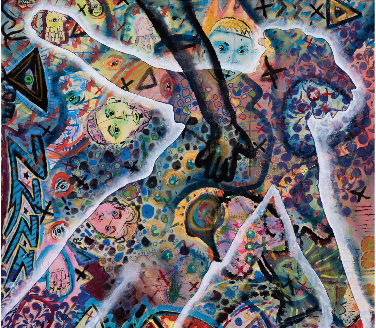
SkyART Just-U.S. Flying or Dying (detail) (2020). Acrylic paint, paint pen, and watercolor on canvas, 67 in x 54 in/170 cm x 137 cm. © SkyART Just-U.S., Chicago, Illinois, USA.