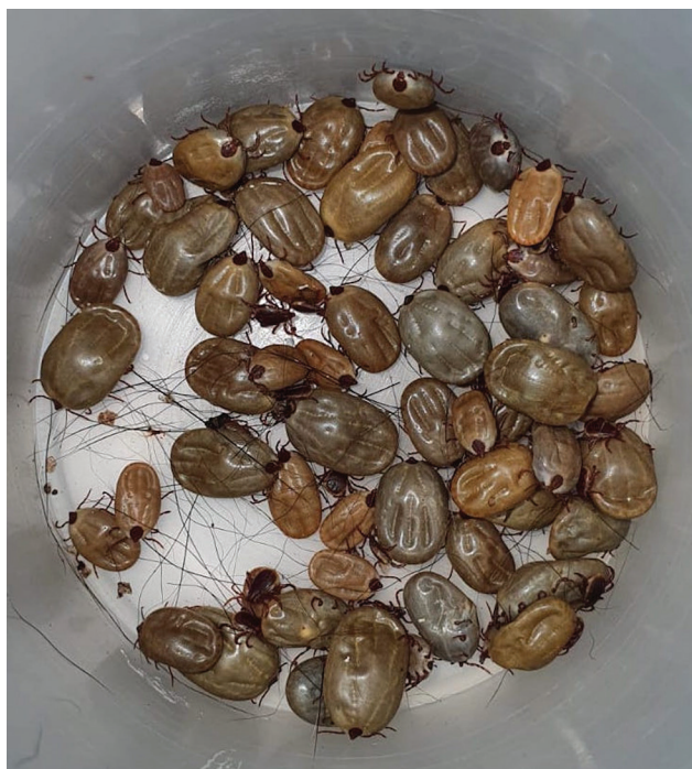
Figure. Brown dog ticks collected by the vector control department of Nuevo Leon, Mexico, in a hard-to-reach municipality.

The work on which this report is based was carried out at the Secretary of Health of Nuevo Leon.