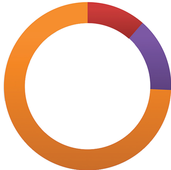
Figure 2. Species of Cronobacter recovered from corn, plantain, and other starches in a study of Cronobacter spp. in common breast milk substitutes, Bogotá, Colombia, 2016.

In Bogotá, no cases of foodborne diseases related to the presence of Cronobacter spp. have been reported. However, Cronobacter are not subject to mandatory reporting in Colombia because no active surveillance of this pathogen exists, and the medical community lacks information about the pathogen. It is important to characterize and document the presence of Cronobacter spp. in different foods to assess the risk to which children <1 year of age and breast-fed infants are exposed and to identify the connection between diseases like meningitis and the consumption of contaminated baby foods produced locally. Some measures have been proposed to mitigate this risk. It is vital to indicate on the starch packaging that starch must be reconstituted in water at \geq 70^{\circ}\text{C} for \geq 1 minute before consumption, and starch leftovers must be refrigerated to minimize the risk for contamination with Cronobacter spp. (15). In addition, the World Health Organization–Codex Alimentarius Code of Hygiene