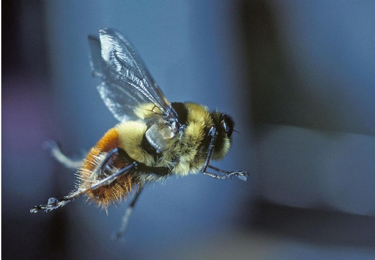
Technical Appendix Figure 1. Female Hypoderma tarandi reindeer warble fly in flight. The parasite can fly for many hours and may cover 600–900 km during its lifetime. This flight capacity has evolved to find reindeers. They do not feed as adults.