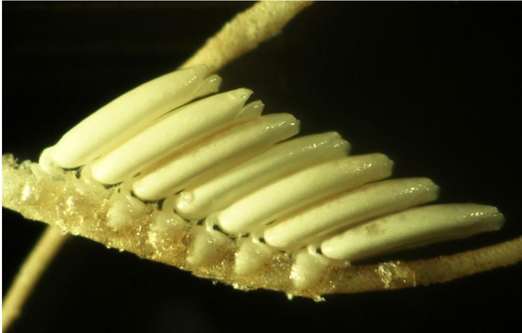
Technical Appendix Figure 2. Eggs of Hypoderma tarandi stick to a reindeer hair with an attachment organ and a glue-like liquid. Upon hatching, the larvae borrow through the skin near the root of the hair shaft.