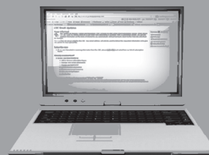
Table of contents Podcasts Ahead of Print Medscape CME Specialized topics