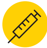
Preventive care and vaccinations