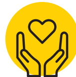
Psychiatric care and mental health services