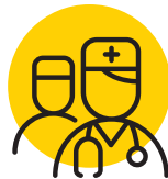
Whole family primary care