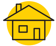
Referrals to housing and social services