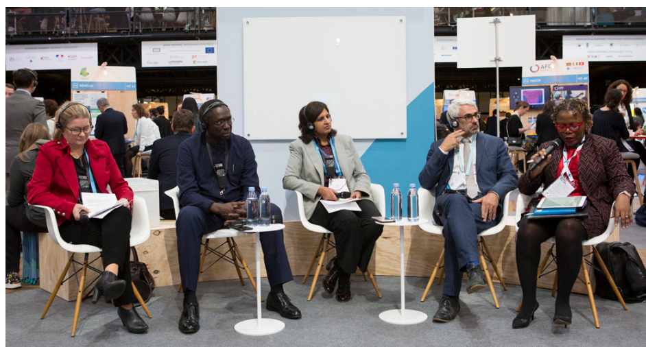
Paris Peace Forum high-level panel, "Fiscal Erosion and Tax Evasion: Connecting the Dots", discussing the impact of TIWB programmes at the Grande Halle de la Villette on 12 November 2018.

In November, the TIWB initiative was proudly featured among key global projects fostering the peace through international co-operation at the recently concluded Paris Peace Forum . The Forum presented an excellent opportunity for the Secretariat to engage global leaders and highlight the initiative's efforts to strengthen co-operation on tax matters and enhance domestic resource mobilisation by developing countries. The TIWB Secretariat is planning another Experts' Roundtable and Stakeholders' Consultative Forum in Paris on 18 February 2019. The Forum will provide opportunities for stakeholders directly involved in TIWB programmes to take stock of progress and share experiences.