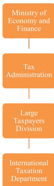
Figure 1. Competent Authority Organisational Structure