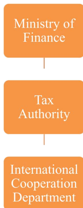
Figure 1. Competent Authority Organisational Structure