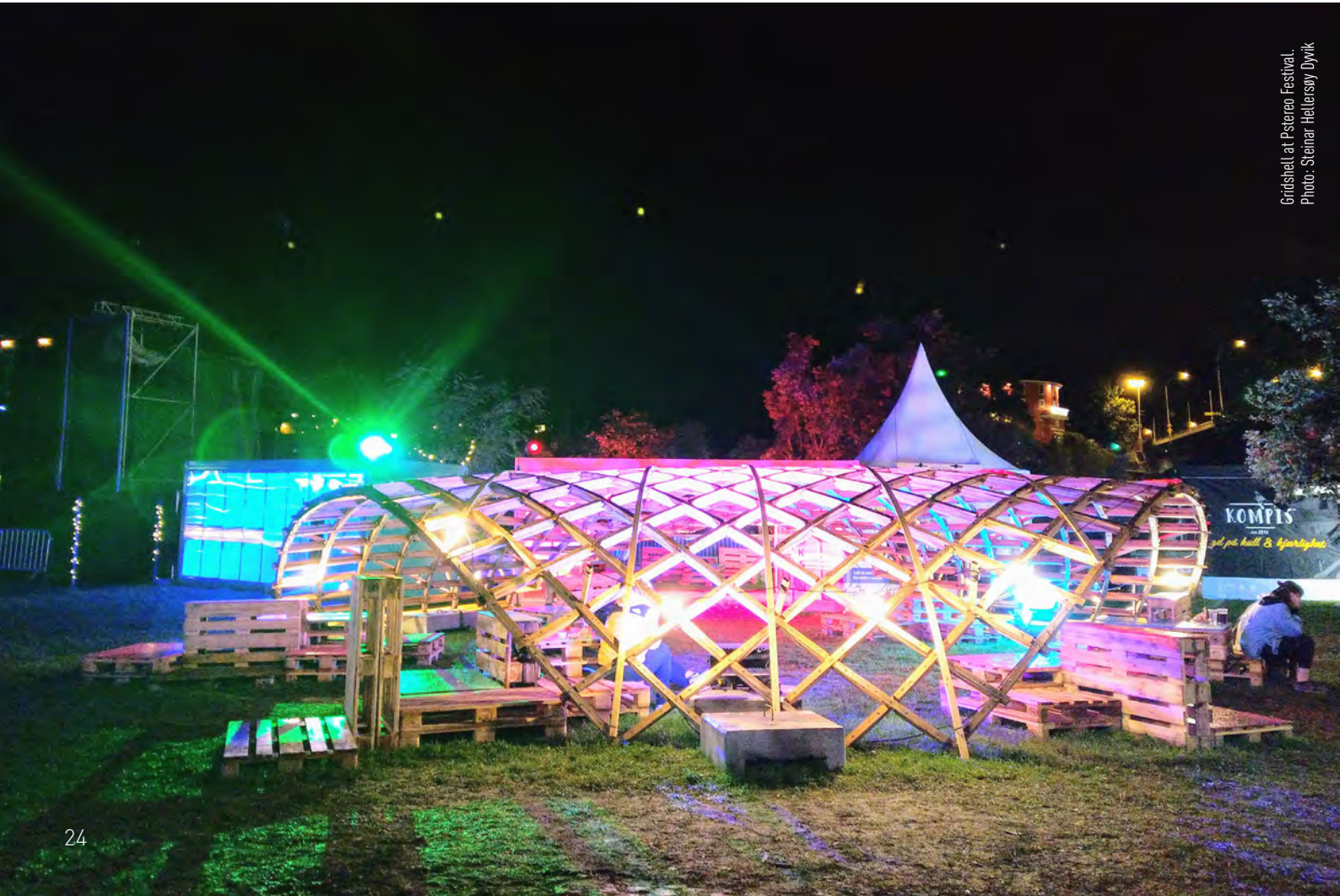
Gridshell at Pstereo Festival.