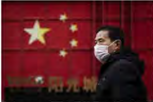
A man wears a protective mask while walking in Wuhan, China, on Feb. 10.