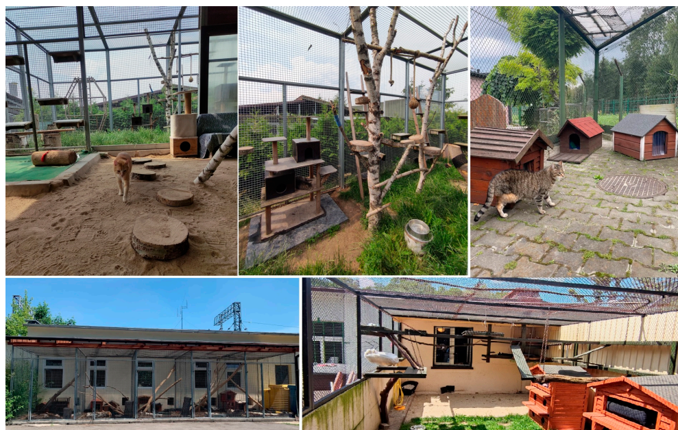
Figure 1. Examples of outdoor aviaries available for cats.

lower the cortisol concentration may be. Kirchbaum called this the washout effect [18]. In cats, this may be related to the frequency of self-grooming [19]. We took 1 cm to determine cortisol in the last month and the highest cortisol concentration section. Since it is assumed that hair grows an average of 1 cm per month [20,21], each cat stayed in the shelter for at least one month and a maximum of two months before collecting biological material. This applies to both the first and second parts of the research. In the first stage, we collected hair from cats that had been living in a standard environment for at least one month. After adding environmental enrichments, we waited at least one month before collecting hair a second time. The cats in the second stage of the research were not the same as those in the first stage, so we didn't use the "shave-reshave" method [22,23].