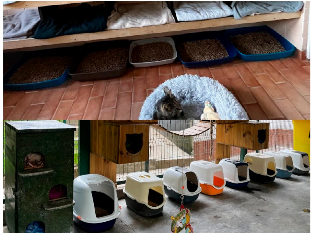
Figure 3. Examples of litter boxes.

tubes. Next, this supernatant was evaporated to dryness under an air-stream suction hood at 37 °C. Dry residue was then dissolved into 1 mL of phosphate-buffered saline (PBS) 0.05 M, pH 7.5. Samples were vortexed for one minute, followed by another 30 s until they were well mixed. The cortisol concentrations in the samples were determined with the DRG Salivary Cortisol HS ELISA assay. The procedures followed the manufacturer's instructions. Cortisol concentrations were expressed in ng/mg.