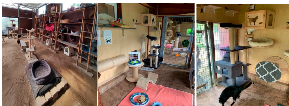
Figure 2. Examples of hiding places, beds, and scratching posts.

Hair was collected only from cats socialized with humans, showing no fear or aggression towards humans. Until biochemical analyses, the material was stored in string bags in a dry place at room temperature, adequately described. More cats used the resources than participated in the research.