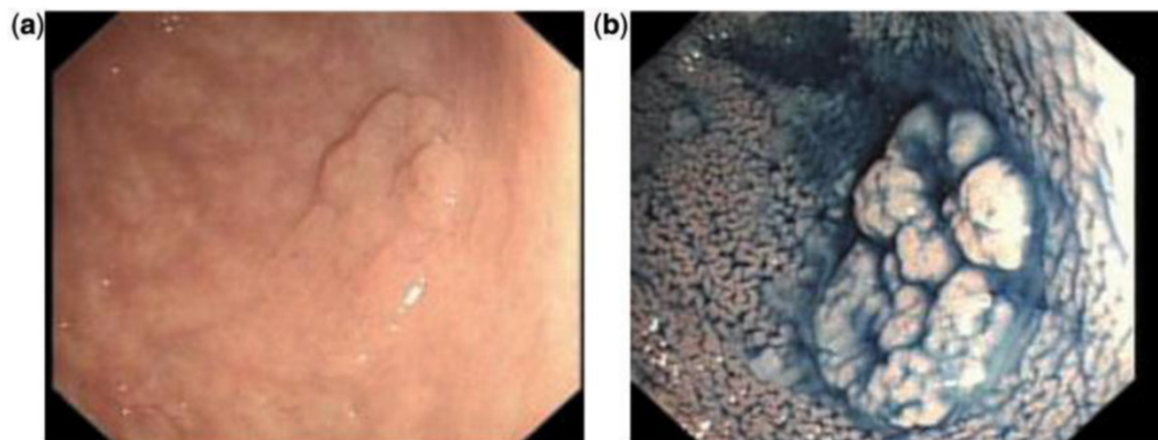
Figure 2. Indigo carmine chromoendoscopy showing mucosal alteration in the sigmoid: (a) before staining and (b) after staining. 49 (With permission Oxford University Press).