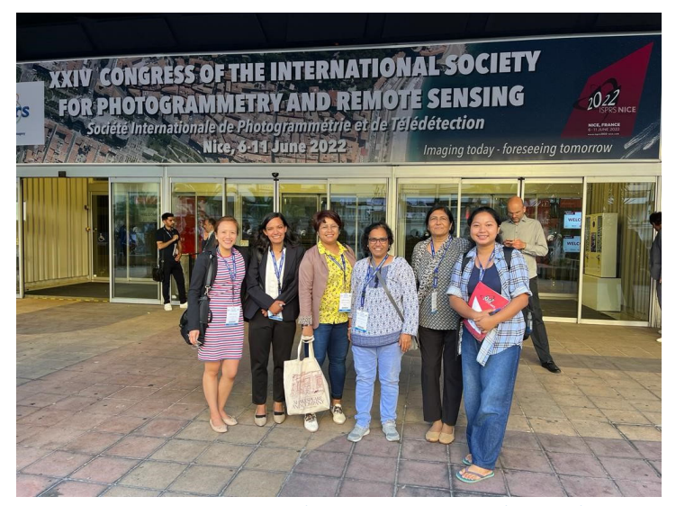
2022 ISPRS Nice Congress Student Consortium members and participants