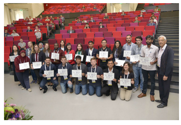
2019 The Netherlands Geospatial Week awardees of TIF Travel Grant

ISPRS Council annually assesses needs and submits requests for support to TIF. Based on availability of funds, TIF Trustees assess the merits of the requests and are the approval authority. Multinational committees (no more than two committee members may be of the same nationality) support the Trustees in evaluating the requests.