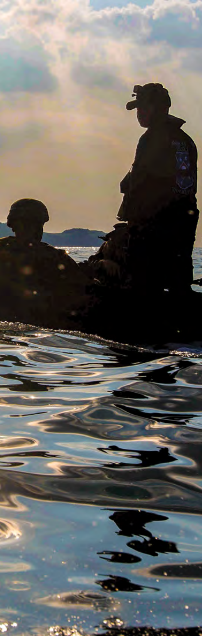
U.S. Marines conduct an amphibious raid during Kamandag 2 at Philippine Marine Corps Base Gregorio Lim, Philippines.