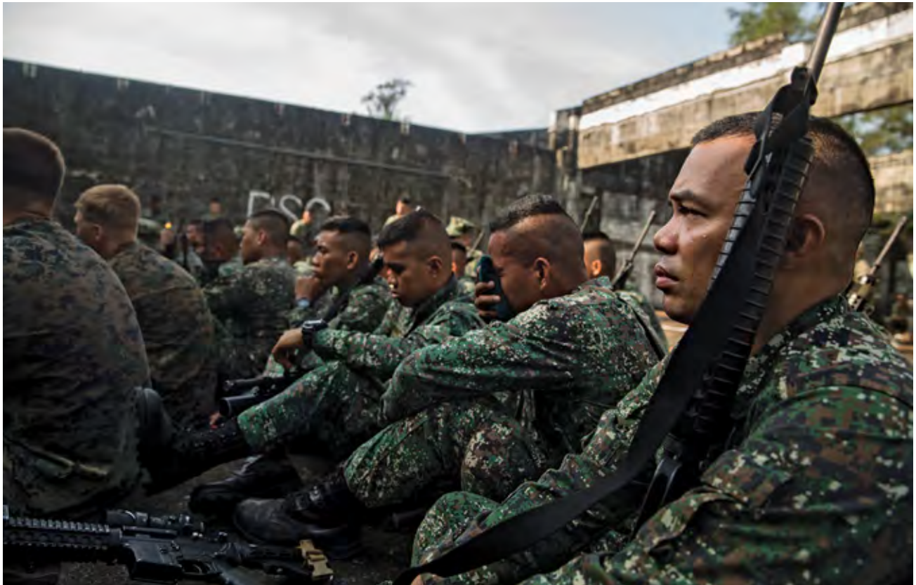
Philippine and U.S. Marines listen to a class during a training exercise.

has resulted in the AFP effectively assuming airborne ISR of a target or operation from overhead U.S. ISR platforms. USSOCPAC reported that AFP special operations forces have increased the level and frequency of coordination between ground forces and air units. USSOCPAC also reported that advise and assist efforts “at the West Mindanao Command Unified Office of Intelligence level has integrated operational planning and employment of the AFP’s organic ISR platforms with their own internal collection planning priorities.” 46