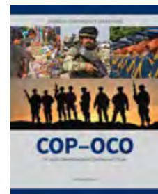
FY 2019 Comprehensive Oversight Plan for Overseas Contingency Operations

This quarter, the Lead IG agencies and their partner agencies completed one report related to OPE-P. As of December 31, 2018, four oversight projects were ongoing, and two were planned. Table 2 lists the project titles and objectives for the ongoing projects, and Table 3 lists the project titles and objectives for the planned projects.