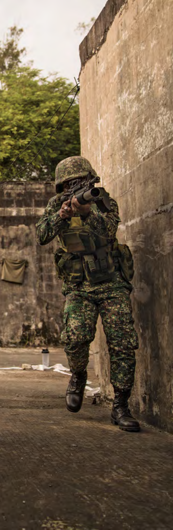
A U.S. and a Philippine Marine clear a room during a training exercise as part of Kamandag 2 in the Philippines.