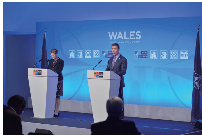
Press conference following the NATO Summit (September 2014)

To counter the threat of ISIL, the EU extends funds to carry out humanitarian assistance for Syria and Iraq. Additionally, the EU works with countries in regions such as the Middle East and North Africa to provide capacity-building assistance in counter-terrorism measures, among other activities.