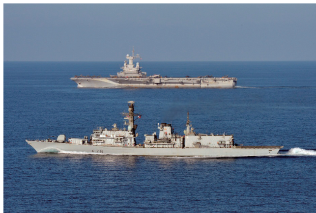
French aircraft carrier "Charles de Gaulle" (back) and U.K. frigate "HMS Kent" (front), which were deployed to the Persian Gulf

France has conducted airstrikes against ISIL in Iraq since September 2014. Following the acts of terrorism in France, it deployed aircraft carrier Charles de Gaulle to the Persian Gulf to enhance its posture in February 2015. In addition, France provides education and training to the Iraqi Security Forces and Peshmerga, as well as extends humanitarian assistance to refugees, in alignment with the efforts of the U.S.-led Global Coalition to Counter ISIL.