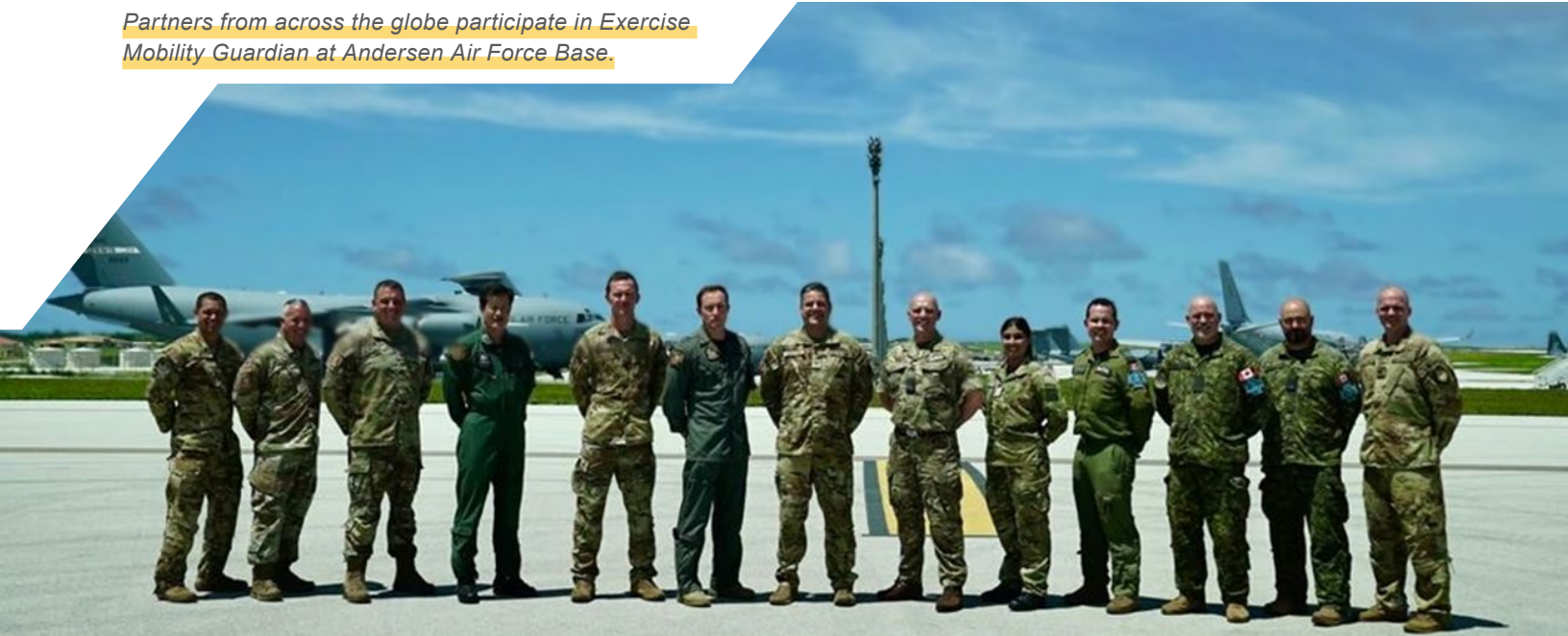
Partners from across the globe participate in Exercise Mobility Guardian at Andersen Air Force Base.