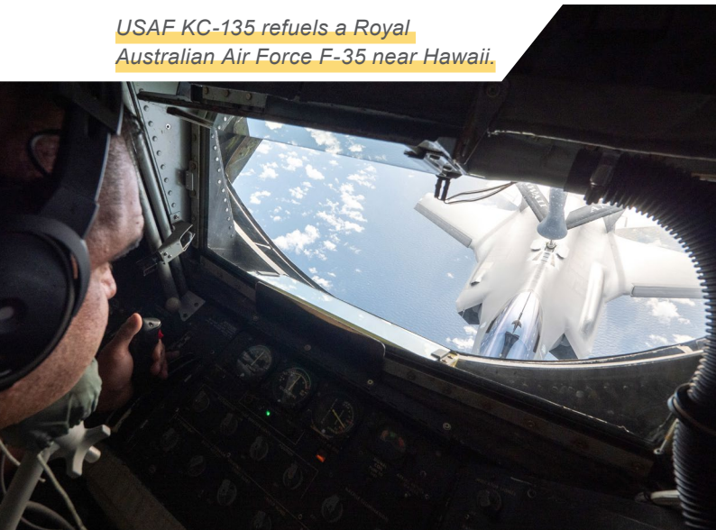
USAF KC-135 refuels a Royal Australian Air Force F-35 near Hawaii.

Integrate Cutting-Edge Capabilities for Operational Advantage. The United States Air Force is building the world's largest 5th-generation fighter fleet, fielding the next-generation stealth bomber, introducing the world's first 6th-generation fighter, and arming aircraft with innovative weapons. As the air component in the United States Department of Defense's priority theater, PACAF must operationalize these technological advancements by employing new tactics and increasing high-end training with the Joint Force, enabling these exquisite airpower tools to realize their full warfighting potential.