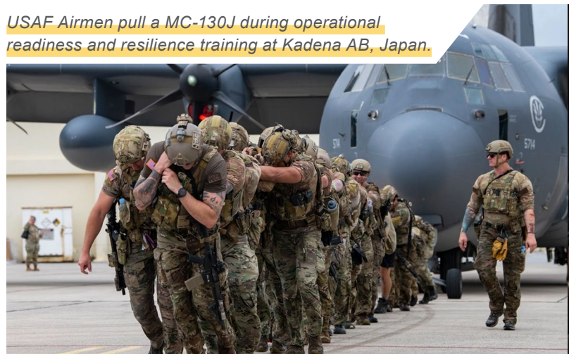
USAF Airmen pull a MC-130J during operational readiness and resilience training at Kadena AB, Japan.