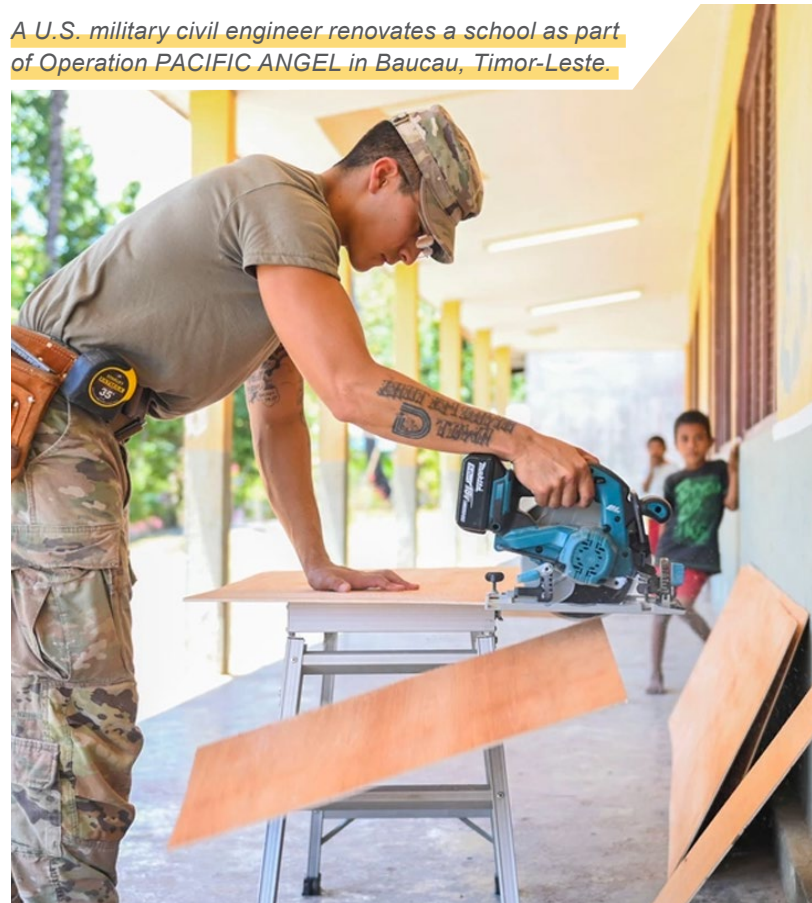
A U.S. military civil engineer renovates a school as part of Operation PACIFIC ANGEL in Baucau, Timor-Leste.