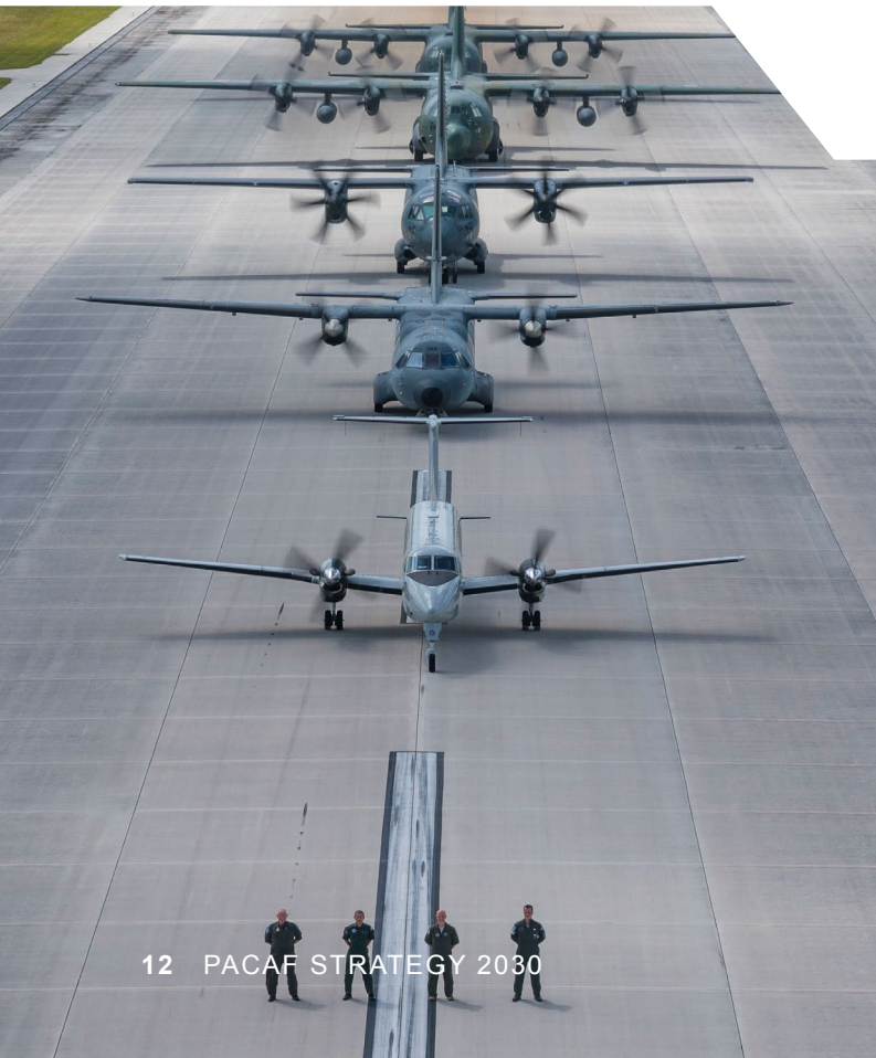
USAF, Japan Air Self-Defense Force, and French Air and Space Force exercise in Guam.

Bolster High-End Combined Training in Strength, Capability, and Geography. Our asymmetric advantage is the expansive global network of like-minded partners who routinely train and exercise with PACAF. Our interoperability and integration exponentially increases our collective capacity and capability to respond to regional crises. PACAF prioritizes multilateral engagements with a focus on high-end training with key Allies while continuing to attract new partners and enhance interoperability with existing ones. Across that spectrum, PACAF will continuously incorporate unilateral and shared interests, maximizing our collective preparedness for a range of scenarios.