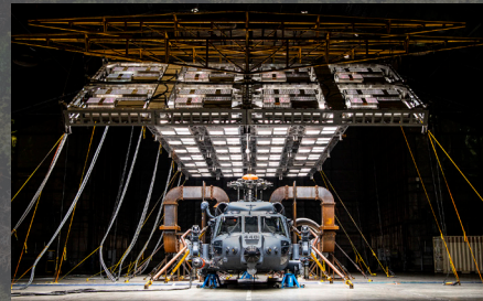
An HH-60W Jolly Green II sits under bright lights used to create heat in the McKinley Climatic Lab March 19 at Eglin Air Force Base, Florida. The Air Force's new combat search and rescue helicopter and crews experienced temperature extremes from 120 to minus 60 degrees Fahrenheit as well as torrential rain during the month of testing. The tests evaluate how the aircraft and its instrumentation, electronics and crew fare under the extreme conditions it will face in the operational Air Force.