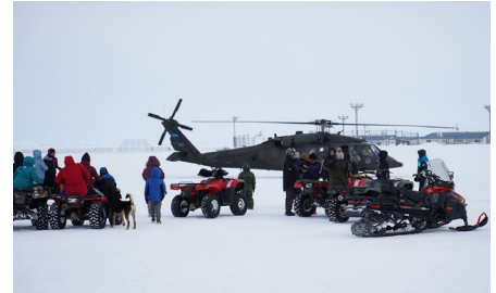
Community members of the city of Chevak, Alaska, meet with tribal leaders and citizens to discuss disaster assistance measures and processes in light of recent emergencies in preparation for the upcoming flood season.

Instituting effective and efficient climate adaptation over the range of DOD missions, operations, and infrastructure requires leveraging all relevant information, methods, technologies, and approaches. This can only be achieved through close collaboration with others. The Department will build unity of effort and mission across DOD components, commands, services, and theaters to exploit lessons learned and economies of scale. Close cooperation with all who have a stake in our national security (other federal agencies, Congress, private industry, academia, NGOs, the American people, and allies), as well as other nations, will help secure our common interests and promote our shared values.