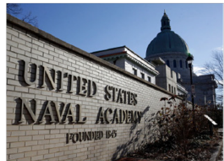
An entrance to the U.S. Naval Academy campus in Annapolis, Maryland (January 9, 2014).