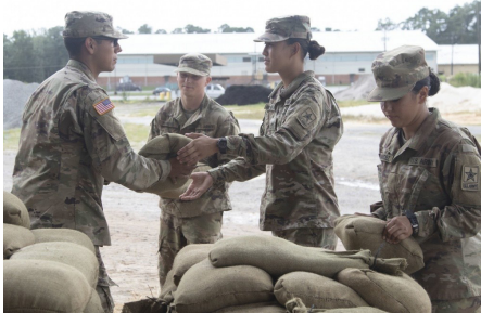
On September 5, 2019, trainees at Fort Jackson, S.C., stack sandbags for use throughout the hurricane season.

Built and natural infrastructure are both necessary for successful mission preparedness and readiness. Built infrastructure serves as the staging platform for the Department’s national defense and humanitarian missions; natural infrastructure supports military combat readiness by providing realistic operational testing and combat environments and conditions. Installations and their built and natural infrastructure also serve as the platforms from which the DOD cares for its people and projects and sustains forces. Many global operational missions are accomplished and/or sustained from DOD installations. Changing climate provides an opportunity to reevaluate use of regional approaches that allow for flexibility to adjust to changing conditions while providing an appropriate level of standardization for resilience, efficiency, and costs.