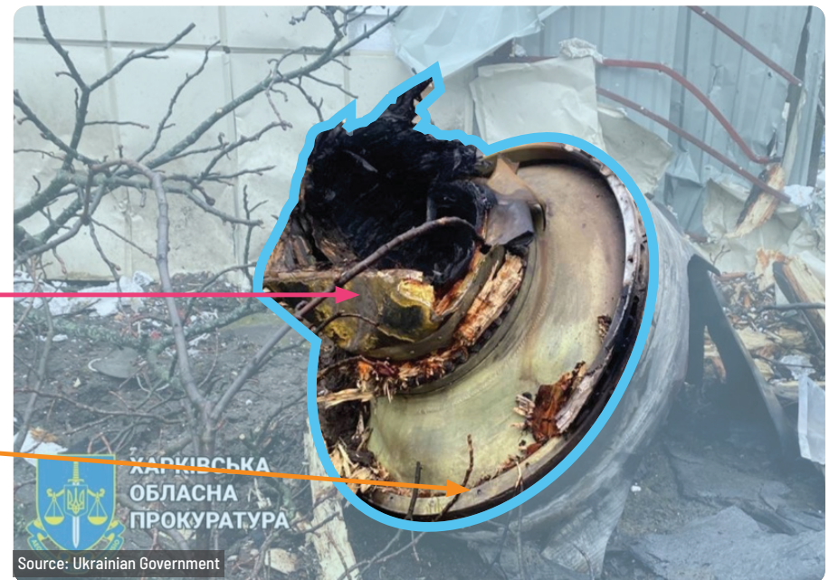
This image of debris found in Kharkiv prominently shows the aft motor section and burned nozzle of a DPRK missile 120