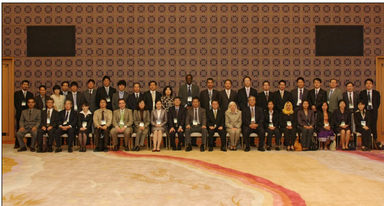
The 3rd Workshop on Reduction of Unintentional POPs in East Asian Countries 1st - 2nd October 2009

Together with the promotion of reducing unintentional POPs through the facilitation of Best Available Techniques/Best Environmental Practices (BAT/BEP) in our country, we will hold “the 3rd Workshop on Reduction of Unintentional POPs in East Asian Countries”, with the purpose of considering the measures and information sharing on the reduction of unintentional POPs in East Asian Countries, including Japan.