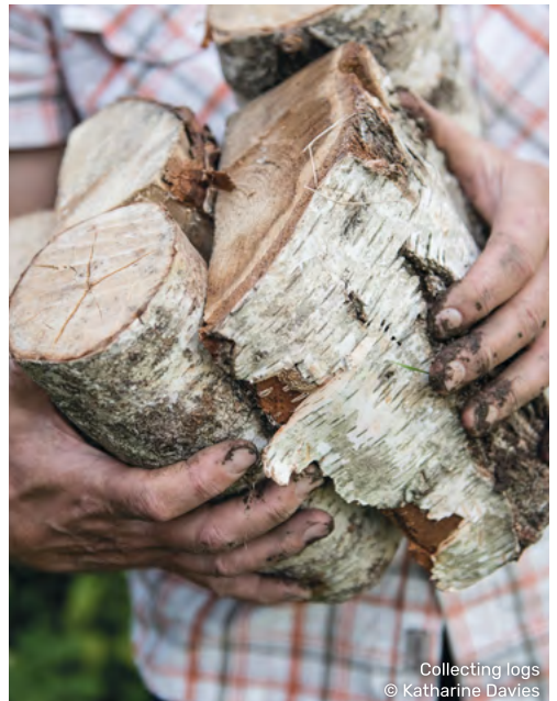
Collecting logs