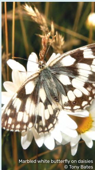
Marbled white butterfly on daisies

Cutting herb plants back hard in midsummer means you gain more fresh herbs and they will flower much later in autumn, providing extra nectar supplies. Try to resist the urge to tidy plants away at the end of the season as they provide vital hibernation sites for many insects throughout the winter.