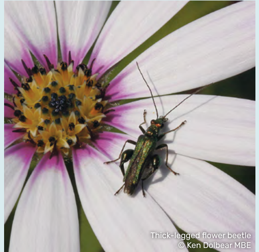
Thick-legged flower beetle