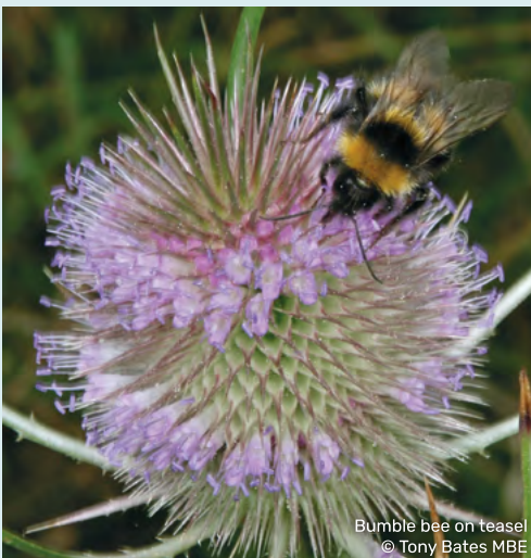
Bumble bee on teasel