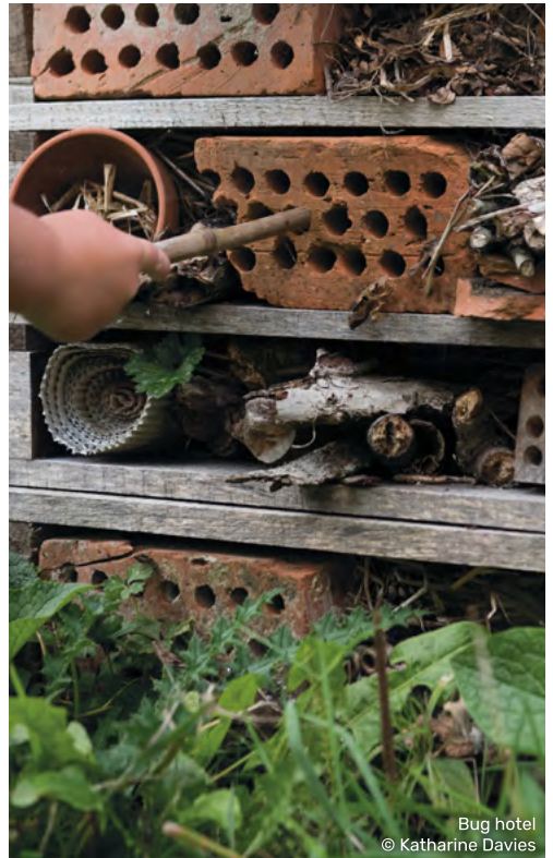
Bug hotel