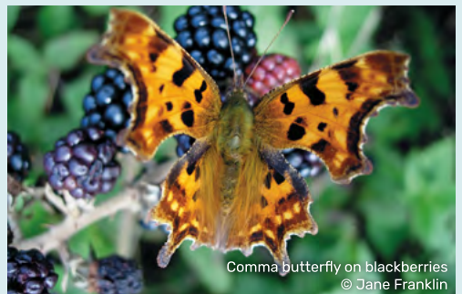
Comma butterfly on blackberries

Pollinators are in decline so what you do in your garden matters!