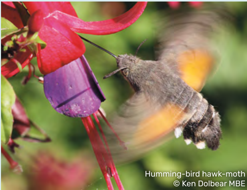
Humming-bird hawk-moth

Pollinating insects include hoverflies, wasps, flies, beetles, butterflies, moths, bumblebees, honey bees and solitary bees. Don't forget to care about the whole lifecycle of our pollinators – butterflies and moths all develop from caterpillars which need a home too!