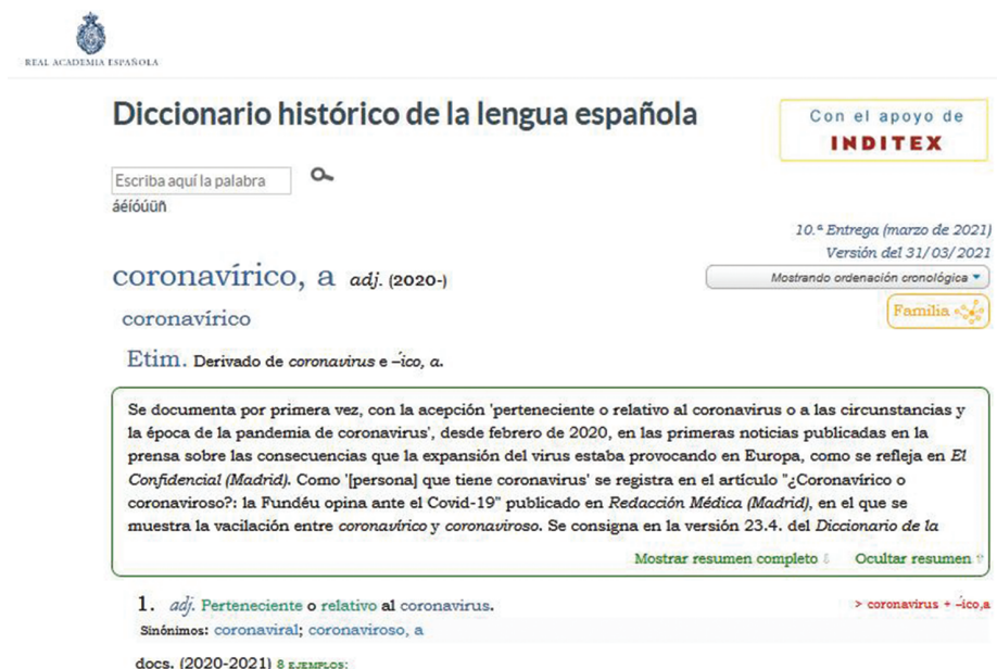
Figure 1: https://www.rae.es/dhle/coronavírico .