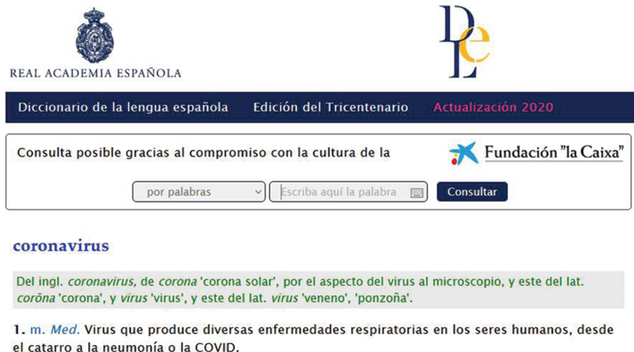
Figure 3: https://dle.rae.es/coronavirus .