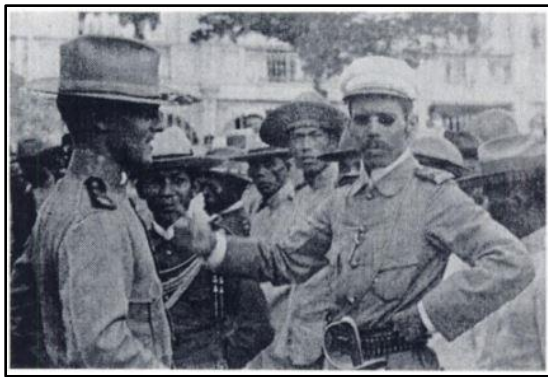
Brigadier General Juan Cailles (right) surrenders to U.S. forces in June 1901.