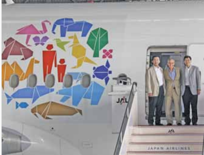
Recognized by the Ministry of the Environment of Japan as an Eco-First company, and based on the airline's commitment to the Eco-First Pledge and to the established Biodiversity Policy of the JAL Group, Japan Airlines sought to raise the awareness of the importance of protecting the diversity of life on Earth and to draw attention to COP 10

Attending to these requests, the Secretariat will build on the results of its work done in 2010, among other things, on outcomes of a global expert workshop on biodiversity benefits of REDD-plus (Nairobi, September 2010), and criteria and indicator guidelines for forest degradation, developed in cooperation with partners in the Collaborative Partnership on Forests (CPF). ❖