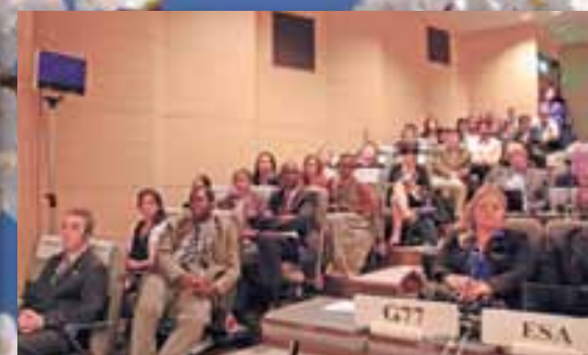
Secretariat staff at the COP 10 opening ceremony