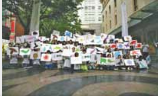
Students marched through the streets of Seoul in celebration of IDB in the Republic of Korea