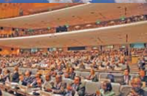
Delegates at the opening of the tenth meeting of the Conference of the Parties (COP 10) in Nagoya

The summit, one of the most successful meetings in the history of the Convention, adopted the Nagoya Protocol on Access to Genetic Resources and the Fair and Equitable Sharing of Benefits Arising from their Utilization following seven years of intense negotiations; the Strategic Plan for Biodiversity 2011-2020, which includes a mission and strategic goals. This package of measure agreed to by governments will ensure that the ecosystems of the planet will continue to sustain human well-being into the future.