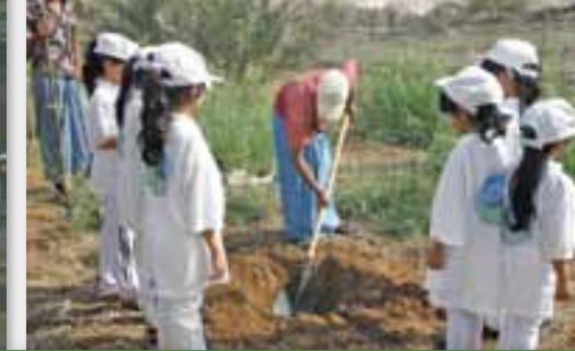
Planting trees to mark IDB in the United Arab Emirates

which resulted in 39,000 sightings and 3,211 observed species.