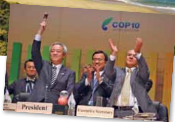
Japan’s Minister of the Environment, Ryu Matsumoto, and Ahmed Djoghlaif, CBD Executive Secretary, celebrate the successful conclusion of COP 10 in Nagoya, Japan

Among the targets, Parties agreed to at least halve and where feasible bring close to zero the rate of loss of natural habitats including forests; protect 17 per cent of terrestrial and inland water areas and 10 per cent of marine and coastal areas; restore at least 15 percent of degraded areas; and