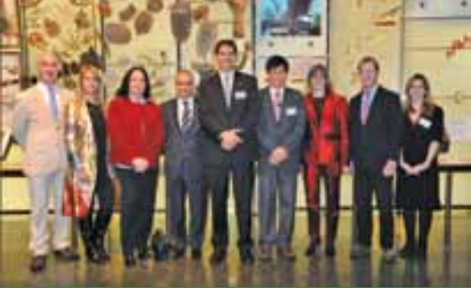
Launch of the International Year of Biodiversity in North America