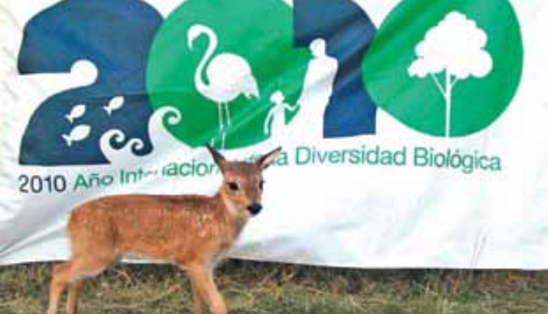
In Uruguay, even four-legged participants helped celebrate IYB