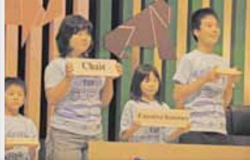
Japanese schoolchildren participated at the opening of MOP 5