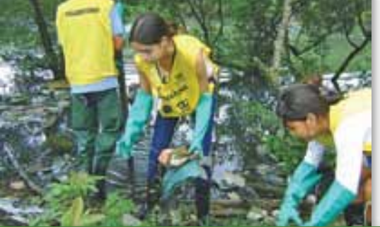
Volunteers in Brazil celebrated the IDB by doing a river cleanup