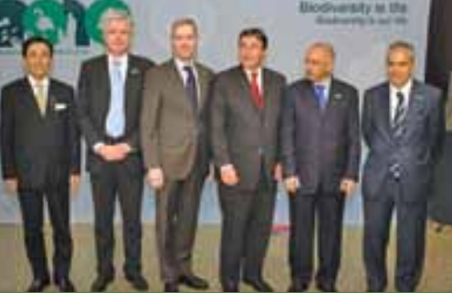
Launch of the International Year of Biodiversity in Germany