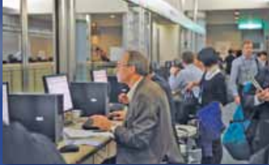
During both COP 10 and MOP 5 media had access to a large media communications centre