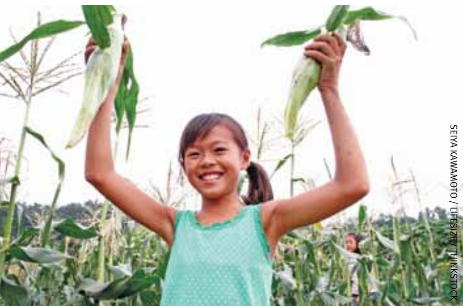
SEIYA KAWAMOTO / LIFESIZE / THINKSTOCK