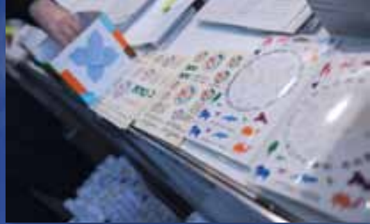
Promotional material at COP 10