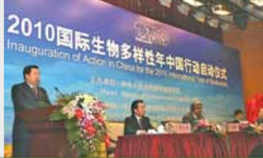
Launch of the International Year of Biodiversity in China

Environment Minister of Yemen, the United Nations Environment Programme Executive Director and the CBD Executive Secretary also delivered statements.