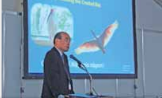
Governor Masanori Tanimoto of Ishikawa Prefecture in Japan addresses the Governor's Summit on 19 October