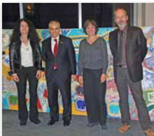
Four artists from Quebec, Canada, created a fresco celebrating the IYB and presented it to the Secretariat