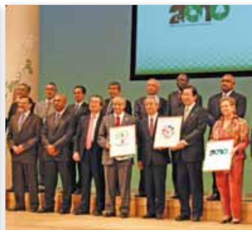
Closing ceremony of IYB in Kanazawa, Ishikawa Prefecture, Japan