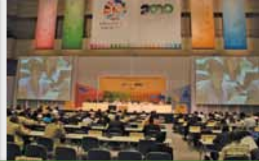
Plenary session at MOP 5