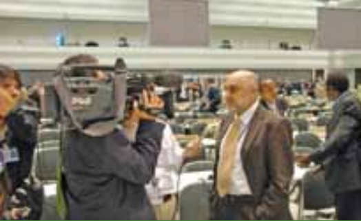
Media coverage, especially in Japan, was generally positive throughout both COP and MOP