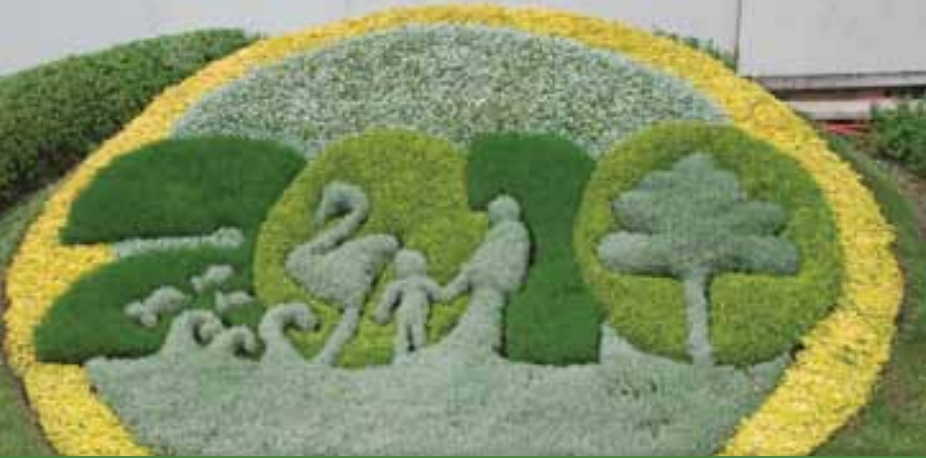
The City of Montreal marked the International Year of Biodiversity with a floral display outside City Hall