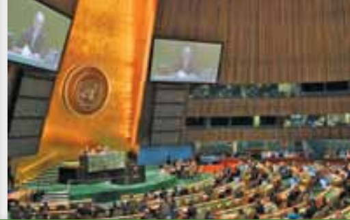
As a contribution to IYB, the UN General Assembly convened a high-level meeting of the General Assembly at its 65th session

The North American launch of the IYB took place in the United States of America on 10 February. The event in New York was convened by the UN Development Programme Equator Initiative and a consortium of partners including Conservation International, Fordham University School of Law, The UN Foundation, the Wildlife Conservation Society and the American Museum of Natural History which hosted the event. Some 400 people attended despite a snowstorm that closed the New York offices of the UN.