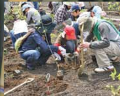
Some 111,000 participants from 1,588 groups in 43 prefectures across Japan took part in The Green Wave for biodiversity on the International Day for Biological Diversity