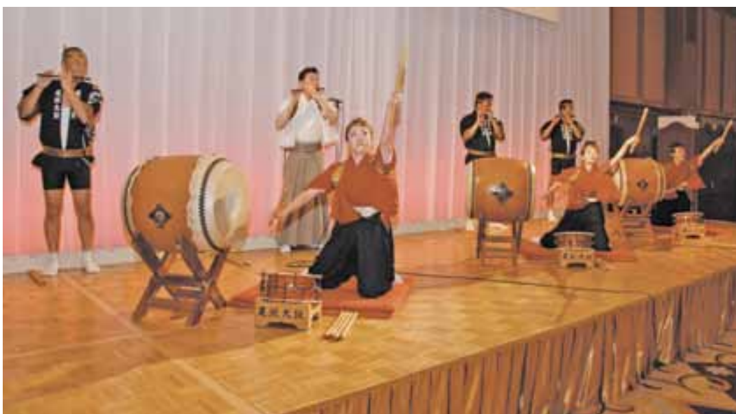
Performers at the MOP 5 reception hosted by the Government of Japan

In October, a fair on national experiences with the implementation of the Protocol took place during COP-MOP 5. More than 30 participants attended a series of presentations held on capacity-building during a lunch event.