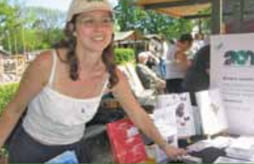
Sweden held its IDB celebrations at the Skansen nature park in Stockholm