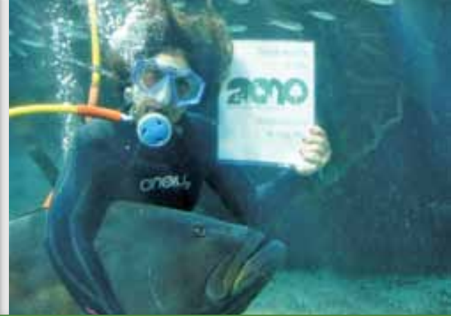
Celebrating the IYB in the Bermuda Aquarium Museum and Zoo

Cayman Islands: Some $80,000 in donations raised by the National Trust in a fund drive went, according to organizers, towards the purchase of land negatively threatened by development.