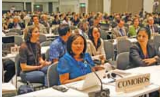
Delegates at the closing plenary of MOP 5