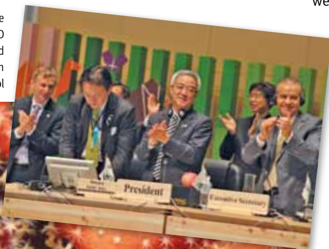
Ryu Matsumoto, Minister of the Environment, Japan, and CBD Executive Secretary Ahmed Djoghlaif celebrate the adoption of the Nagoya Protocol

By helping to ensure benefit-sharing, the Protocol creates incentives to conserve and sustainably use genetic resources, and therefore enhances the contribution of biodiversity to development and human well-being.