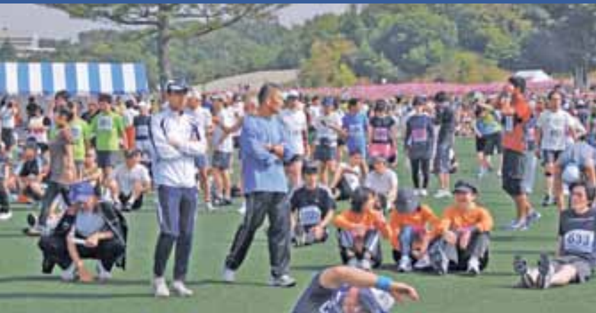
The Naturathlon is an annual sporting event that encourages people to conserve nature. At the COP 10 Naturathlon 2010 – “The Course of the World”, scores of delegates and Japanese citizens alike ran the 10km course with one common goal – the importance of biodiversity