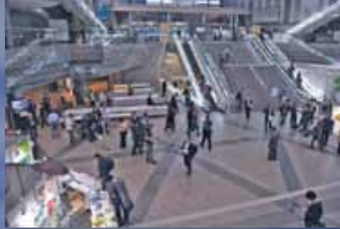
Nagoya Congress Center