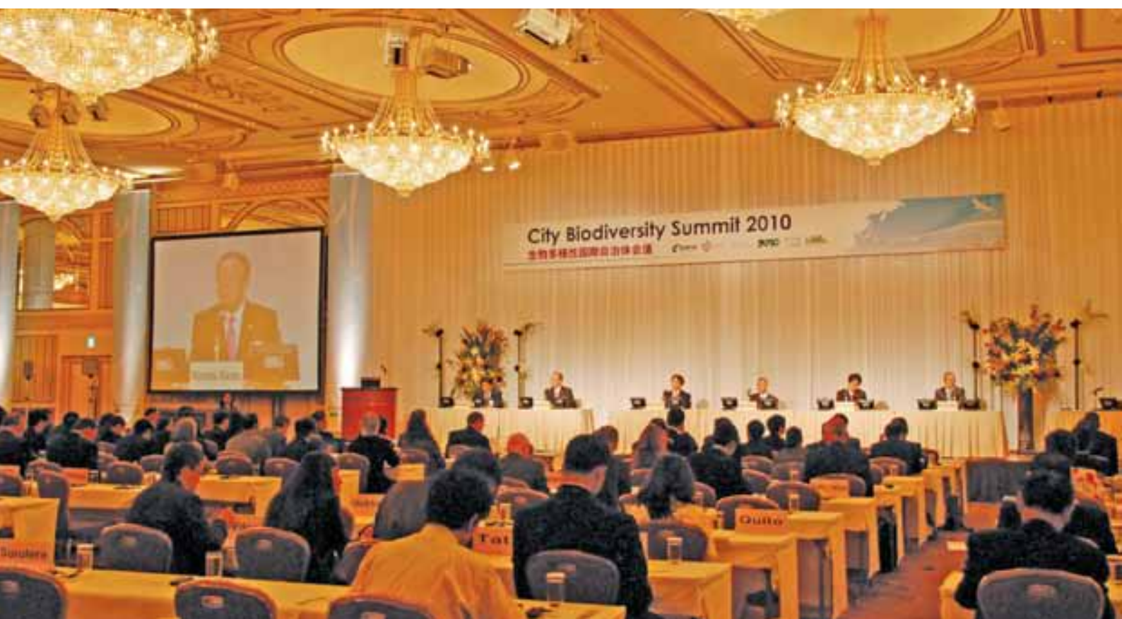
Participants at the City Biodiversity Summit

The Plan of Action provides non-prescriptive guidelines to assist national governments in aiding local governments to implement the objectives of the CBD.