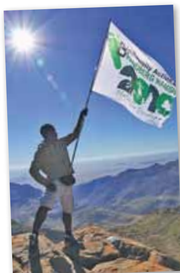
IYB logo even reached the top of the Brandberg in Namibia

There are greater opportunities than identified in earlier assessments to address the biodiversity crisis while contributing to other social objectives; for example, by reducing the scale of climate change without large-scale deployment of biofuels and accompanying loss of natural habitats. (Global Biodiversity Outlook 3)