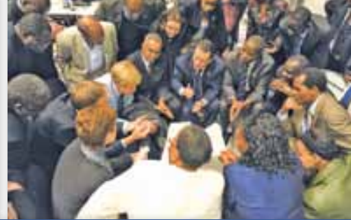
Ministers and delegates gather to debate during the final plenary of COP 10

plant and animal health, as well as through early warning mechanisms, rapid response measures and management plans.