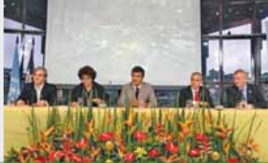
Launch of the International Year of Biodiversity in Brazil