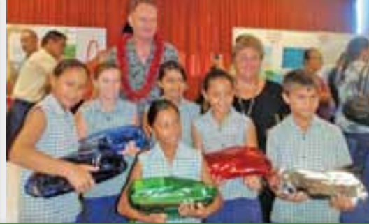
Participants at IDB celebrations in Samoa