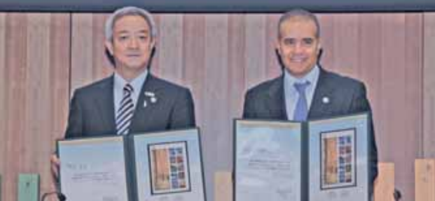
Ryu Matsumoto, Minister of the Environment for Japan, and CBD Executive Secretary Ahmed Djoghlaif, pose with stamps issued by Japan Post to commemorate COP 10