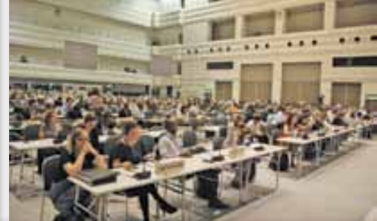
Delegates at the 13 October plenary session