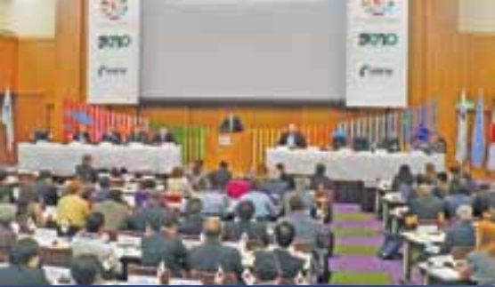
122 parliamentarians of the world adopted the Nagoya Declaration on Parliamentarians and Biodiversity