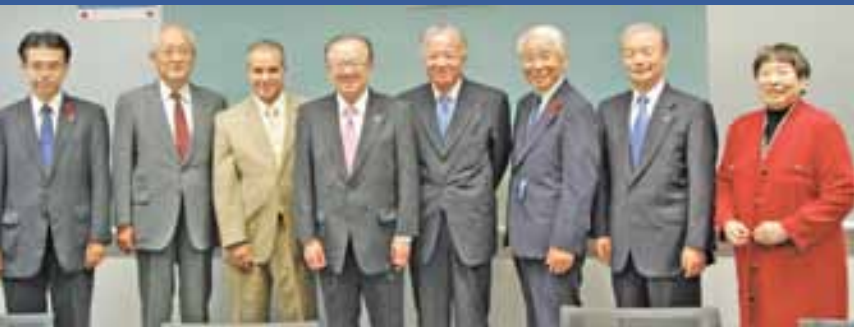
The Biodiversity Governors’ Summit, an international symposium, was held on 19 October in which governors and vice governors from Aichi, Ishikawa, Hyogo, Shiga and Shizuoka as well as academics and experts, presented their approaches and actions for the conservation of Satoyama and Satoumi and its contribution to the revitalization of local communities