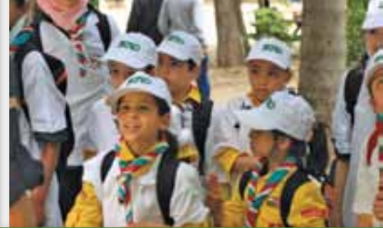
Scouts helped celebrate IDB in Algeria