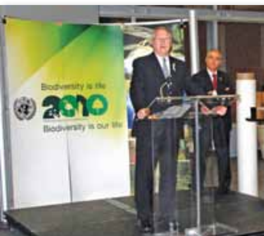
Montreal Mayor Gerald Tremblay speaks at the Canadian closing of the IYB

In his message to the official closing, UN Secretary-General Ban Ki-moon noted, "Under the slogan 'One UN for Biodiversity', the