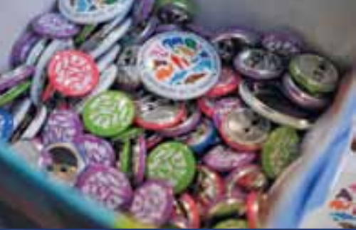
Promotional material, including pins, provided by the Japanese Ministry of Environment proved popular with participants at COP 10