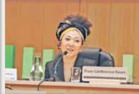
Japanese singer MISIA was the Honorary Ambassador for COP 10

themselves reduced or eliminated. With rising human population and income, the demand for biological resources is increasing, and without action this will translate into increased pressures on biodiversity.