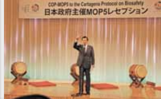
Michihiko Kano, Japan's Minister for Agriculture, Forestry and Fisheries and MOP 5 President, welcomes delegates to a reception hosted by the Government of Japan in the Nagoya Kanko Hotel

Training was held 15-17 February 2010 in Tsukuba, Japan. The meeting enabled participants to share information and experiences about biosafety programmes and make recommendations to further improve biosafety education and training programmes to COP-MOP 5.