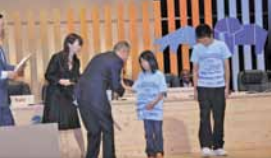
Opening ceremonies of the fifth meeting of the Conference of the Parties serving as the Meeting of the Parties (MOP 5) to the Cartagena Protocol on Biosafety