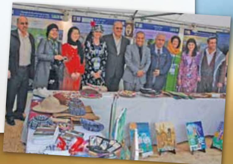
The inauguration of the Iraq stand at COP 10

As of late 2010, 170 Parties have created NBSAPs. Including Japan, 32 countries have revised theirs. Another 16 are presently under revision. Only 9 Parties (including two countries - Iraq and Somalia - that recently acceded to the CBD) have yet to provide the Secretariat of the Convention information about the status of their NBSAPs.