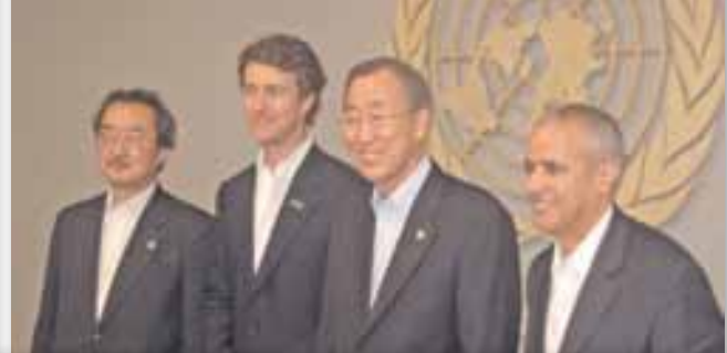
UN Secretary-General Ban Ki-moon, second from right, appointed conservationist and acclaimed actor Edward Norton, second from left, United Nations Goodwill Ambassador for Biodiversity in July.