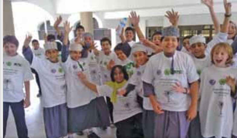
Celebrating IYB in Oman

by the German Ministries for Environment and Economic Co-operation and Development in co-operation with GEO magazine.