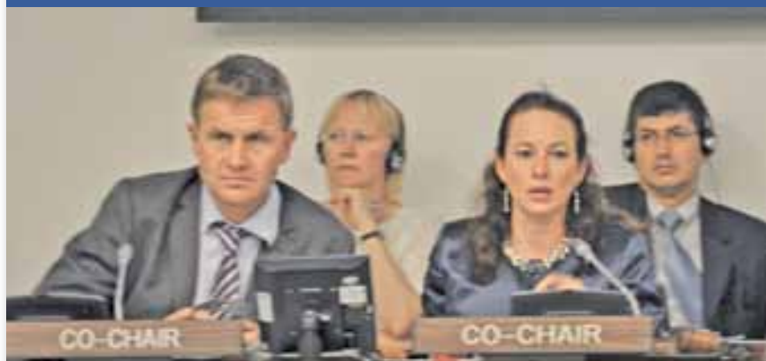
The afternoon panel of the High-Level meeting of the UN General Assembly on biodiversity in September was co-chaired by Erik Solheim, Norway's Minister for the Environment and International Development, and María Fernanda Espinosa, Ecuador's Minister for Heritage