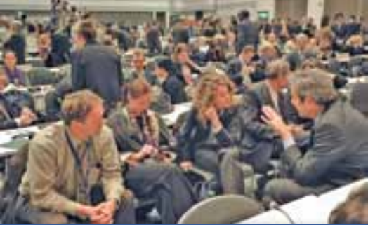
Delegates engaged in discussion during the plenary session on 29 October