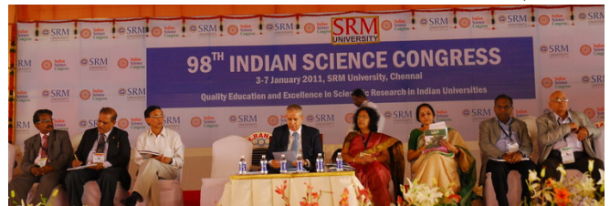
ES-CBD (center) at the Indian Science Congress