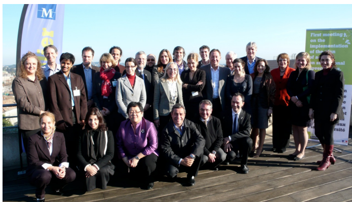
Participants of the Montpellier meeting

In preparation for the COP-MOP 6 and COP 11 meetings, the CBD Executive Secretary travelled to New Delhi to meet with officials from the Ministry of Environment and Forests. Bilateral meetings were held with H.E. Jairam Ramesh, Minister of Environment and Forests, as well as with other senior officials from the Ministry. While in India, the CBD Executive Secretary also attended the 98th Indian Science Congress in Chennai, and was invited to take part in one of the plenary sessions of the meeting.