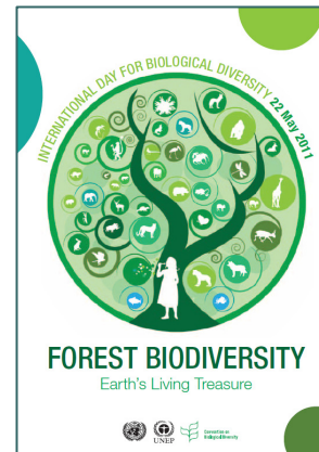
International Day for Biological Diversity 2011 Booklet