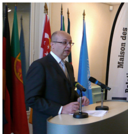
Jean-Pierre Thébault, France's Ambassador for the Environment

Pursuant to COP Decision X/22, adopted at the Nagoya Biodiversity Summit last October 2010, the City of Montpellier, with the support of the French Government, hosted the first meeting on the Implementation of the Plan of Action on Sub-National Governments, Cities and Other Local Authorities on Biodiversity on 17-19 January 2011. The meeting was attended by 38 participants representing more than