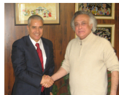
ES-CBD with Minister Ramesh