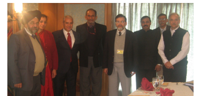
ES-CBD with officials from MoEF, India