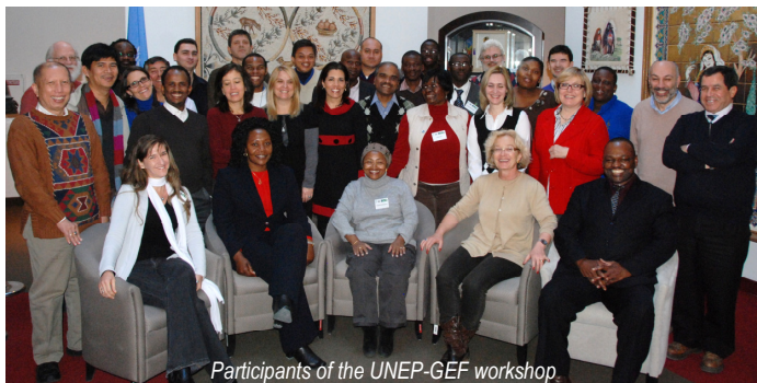
Participants of the UNEP-GEF workshop.

The main training components involved a thorough revision of all of the features currently available through the BCH as well as an in-depth analysis of the project details. The training also incorporated group work, role playing, and feedback on making BCH improvements. The anticipated result of the training, and also of the BCH-II capacity building project, is that BCH Regional Advisors will be able to further assist countries in the design, development and expansion of national BCH activities, in particular, information registration and national data processing in the BCH, among others.