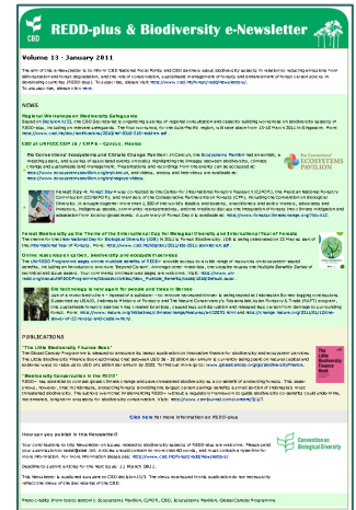
REDD-plus and Biodiversity e-Newsletter January 2011, Volume 13