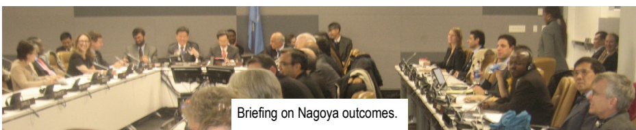
Briefing on Nagoya outcomes.

To view the statement by the U.N. Secretary General in welcoming the Nagoya Protocol, please go to: http://www.un.org/News/Press/docs/2010/sgsm13216.doc.htm