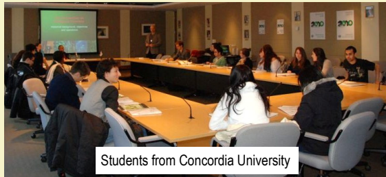
Students from Concordia University