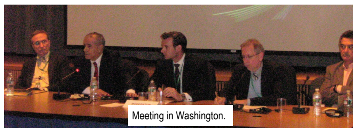
Meeting in Washington.

The thirty-ninth meeting of the Council of the Global Environment Facility was held from 16-18 November 2010 in Washington, D.C., United States of America. The GEF Council noted the success of the tenth meeting of the Conference of the Parties, and discussed the proposal of a Japanese ABS Trust Fund to support a multilateral benefit sharing mechanism and technology transfer as well as the request for establishing a South-South Biodiversity Fund. The Council agreed that the GEF shall launch a pilot on accrediting new agencies under Paragraph 28 of the Instrument, and priority shall be given to the accreditation of national institutions. The CBD Executive