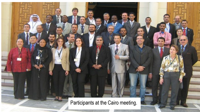
Participants at the Cairo meeting.

The CBD Secretariat in collaboration with League of Arab States and UNEP/ROWA organized the regional workshop on biodiversity and finance in Cairo, Egypt from 29-30 November 2010. The meeting was attended by 51 participants, from 17 Arab countries and 14 regional and international organizations, and agreed to a 16-point Arab regional statement for action on the 2020 biodiversity targets, funding strategies and innovative financial mechanisms in response to the Aichi Target, which will be implemented by the Arab region with support from regional and international organizations.