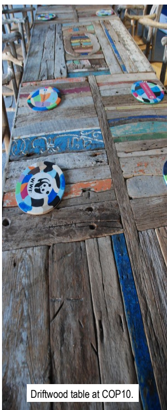
Driftwood table at COP10.