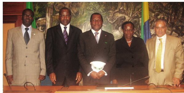
Gabon Environment Minister Rufin Pacome Ondzounga (center) attended the meeting, as well as the Deputy Environment Minister of South Africa Rejoice Mabudafnasi.

the 10th Conference of Parties (COP 10) of the Convention of Biological Diversity in Nagoya, Japan in October. The high level conference was organized by the Government of Gabon in partnership with the Secretariat for the Convention on Biological Diversity (CBD) and the International Union for Conservation of Nature (IUCN), with support from the African Union Commission (AU), African Ministerial Conference on the Environment (AMCEN), the United Nations Environment Programme (UNEP) and the UN Economic Commission for Africa (UNECA).