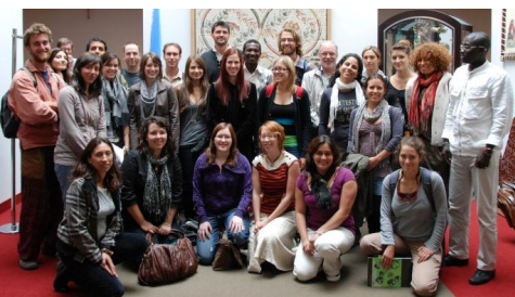
Students from the Research Institute on Vegetable Biology

Students from the Research Institute on Vegetable Biology of the Botanical Gardens of Montreal visited the Secretariat on 14 September, a briefing was made by relevant CBD staff on the work of the Convention.