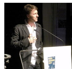
Edward Norton delivering remarks at the WCS-CBD reception.