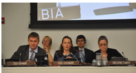
Environment Minister Solheim (Norway) and Heritage Minister Espinosa (Ecuador) co-chairing one of the thematic panels on biodiversity.

The meeting was chaired by the President of the 65 th session of the UNGA, and statements were made by: UN Secretary General, Chairman of the G-77, Environment Ministers from Brazil and Germany, Japanese Foreign Affairs Minister; and the