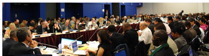
View of the ING-ABS meeting at the Palais des congrès de Montréal.

A meeting of the Interregional Negotiating Group (ING), established to negotiate a draft international protocol on access and benefit-sharing (ABS) convened on 18-21 September 2010 in Montreal, Canada. While key issues remained outstanding, the meeting saw some progress towards an improved common understanding on key elements of the international ABS regime, most notably on the concept of utilization of genetic resources and its relation to derivatives, and on provisions on benefit-sharing and access. The results of the meeting will be transmitted to the ABS Working Group, which will reconvene prior to the COP10 meeting in Nagoya. It is expected that COP10 will finalize and adopt the ABS Protocol.