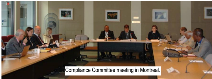
Compliance Committee meeting in Montreal.

The seventh meeting of the Compliance Committee under the Cartagena Protocol on Biosafety took place in Montreal from 8 to 10 September 2010. The Committee continued discussions of items that it examined at its previous meeting relating to national reporting rates and status of compliance in fulfilling obligations to make information available to the BCH. It also considered the views submitted by Parties on how to improve the supportive role of the Committee. The Committee finalized its recommendations and report for submission to the fifth meeting of the COP-MOP.