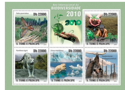
Sao Tome and Principe