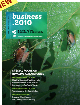
Business.2010 Newsletter - Vol. 4 Issue 1 (June 2009) Special Focus on Invasive Alien Species http://www.cbd.int/doc/newsletters/news-biz-2009-06-en.pdf