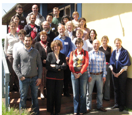
Participants at the meeting.

The Second European Workshop on NBSAPs and Mainstreaming of Biodiversity was held from 12 to 16 June 2009 in the Isle of Vilm, Germany, with the generous support of the German Federal Agency for Nature Conservation and the International Academy for Nature Conservation of Germany. A total of 25 participants attended the workshop. The workshop provided an opportunity for countries to exchange experiences and lessons learned in the development, implementation and updating of NBSAPs and mainstreaming of biodiversity into relevant sectors and broader strategies. The workshop introduced and discussed about important tools and concepts in this regard, such as strategic environmental assessment, the resilience thinking and the ecosystem services. The workshop also introduced the guidelines and relevant tools for preparation of the fourth national report, and a few countries shared their experiences in this regard, including use of indicators for reporting. In conclusion, while looking at ways forward, participants shared their thoughts for planned activities including celebration of the International Year of Biodiversity in 2010. All the participants considered this workshop very successful.