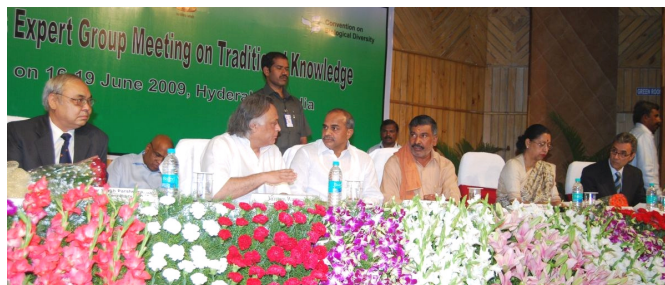
Hyderabad meeting: opening plenary.

The meeting of legal and technical experts on traditional knowledge was convened in accordance with decision IX/12 of the Conference of the Parties on access and benefit-sharing. The meeting was opened by the Chief Minister of the State of Andhra Pradesh of India, Dr. Y.S. Rajasekhara Reddy, and the Minister of Environment and Forests of India, Dr. Shri Jairam Ramesh. The purpose of the meeting was to provide legal and technical advice to the Ad Hoc Open-ended Working Group on Access and Benefit-sharing on the issue of traditional knowledge associated with genetic resources, with a view to assisting the negotiations of the International Regime on Access and Benefit-sharing. Indigenous and government nominated experts from around the world had cordial and constructive exchanges of views throughout the four days of deliberations on the specific questions posed to the experts by the Conference of the Parties. The final report includes some concrete advice and recommendations on how to address traditional knowledge associate with genetic resources in the International Regime. It should greatly facilitate the negotiations on this important issue at the next meeting of the Working Group mandated to negotiate the International Regime, in November 2009. The meeting provided an opportunity for the Ministry to present the fourth national report of India to the Secretariat.