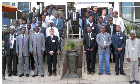
Participants at the LDC Workshop on the 4th National Report.

With the support of Norway and UNEP GEF, the Workshop for Least Developed Countries on the Fourth National Reports was held from 4 to 8 May 2009 in Addis Ababa, Ethiopia. A total of 23 countries, mostly from Africa, participated in this workshop. The workshop provided a very good opportunity for them to learn more about how to prepare the fourth national report and improve and finalize their draft reports or chapters. All the participating countries indicated that this workshop was very helpful for finalizing and submitting their reports in a timely manner.