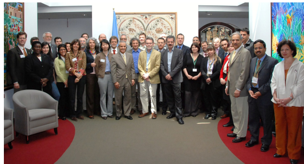
Participants at the Biodiversity for Development Cooperation meeting.

One of the important outcomes of the workshop was a strong consensus amongst participants to formalise a network that will continue to meet on a regular basis to exchange information and experience. The final report of the meeting will be made available on the CBD website once finalized. For more information on CBD's biodiversity for development, please visit: http://www.cbd.int/development .