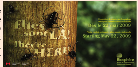
Announcement - Biosphere outdoor photo exhibit on invasive alien species "They're here!".

For IBD 2009 pictures at the Biosphere event , please visit: http://www.cbd.int/photos/ .