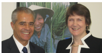
Ahmed Djoghlaflaf, CBD Executive Secretary, with Helen Clark, new Administrator of UNDP.

Taking advantage of the presence of the three Executive Secretaries of the Rio Conventions in New York, the ninth meeting of the Joint Liaison Group of the Rio Conventions was held on 14 May 2009. The meeting took stock on activities agreed at the previous JLG meeting and to further define proposals for joint activities, in particular collaboration towards the International Year of Biodiversity in 2010. The three Executive Secretaries had a working lunch with the Director of the United Nations Forum on Forests .