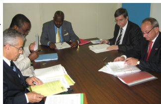
Ninth meeting of the Joint Liaison Group of the Rio Conventions.

While in New York, the CBD Executive Secretary had an opportunity to meet with senior UN and government officials, including the new Administrator of UNDP , a number of Ministers of Environment at the CSD meeting.