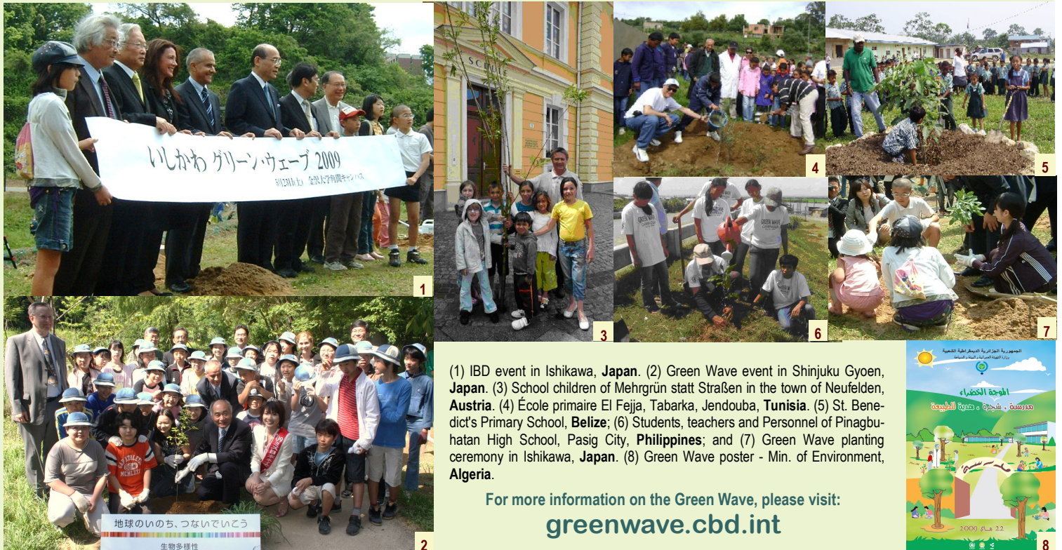
(1) IBD event in Ishikawa, Japan . (2) Green Wave event in Shinjuku Gyoen, Japan . (3) School children of Mehrgrün statt Straßen in the town of Neufelden, Austria . (4) École primaire El Fejja, Tabarka, Jendouba, Tunisia . (5) St. Benedict's Primary School, Belize; (6) Students, teachers and Personnel of Pinagbuhatan High School, Pasig City, Philippines ; and (7) Green Wave planting ceremony in Ishikawa, Japan . (8) Green Wave poster - Min. of Environment, Algeria .

Celebrated each year on 22 May, this year's Green Wave draws attention to the problem of invasive alien species, which is also the theme of this year's IBD. One of the biggest threats to biodiversity due to careless human activities, invasive alien species can cause economic or environmental harm or adversely affect human health, exacerbate poverty and threaten development through their impact on agriculture, forestry, fisheries and natural systems.