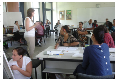
Above: Participants are talking about challenges and issues related to tourism in the Pacific Region.

With the generous support of the Government of Spain, the SCBD held the second workshop of the series on new information and web-based technology in partnership with the Secretariat for the Pacific Region Environment Programme (SPREP) and the New Zealand Tourism Research Institute (NZTRI) of Auckland University of Technology. The workshop took place in Samoa and brought together 22 indigenous tourism operators or owners from 11 islands of the Pacific region. Participants in the workshop used web-based tools to more effectively communicating the biodiversity concepts of their biodiversity-friendly tourism products. The final report of the meeting is available at : http://www.cbd.int/doc/?meeting=WSTOURIDG-02 . For more details on the workshop Series, please visit: http://www.cbd.int/tourism/wstour-01.shtml .