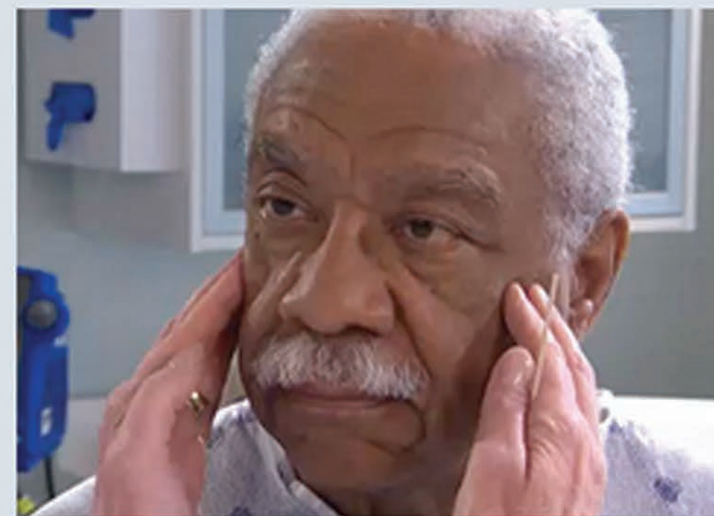
Nervous System: Cranial Nerves