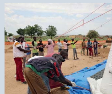
The sandy ground is levelled and prepared.