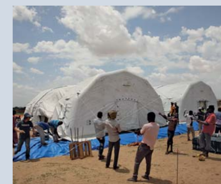
MSF logisticians set up the specially adapted cooling and heating systems, while water and sanitation engineers establish a water supply.

In June, more than 15,000 people fled fighting in Sudan and crossed into Chad, making their way to the small border town of Adré. Many were war-wounded and in desperate need of emergency trauma surgery.