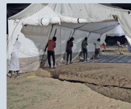
The tents are erected manually, with some elements inflated by mechanical air pumps. Each tent is equipped with pressure gauges to adapt to changing temperatures.