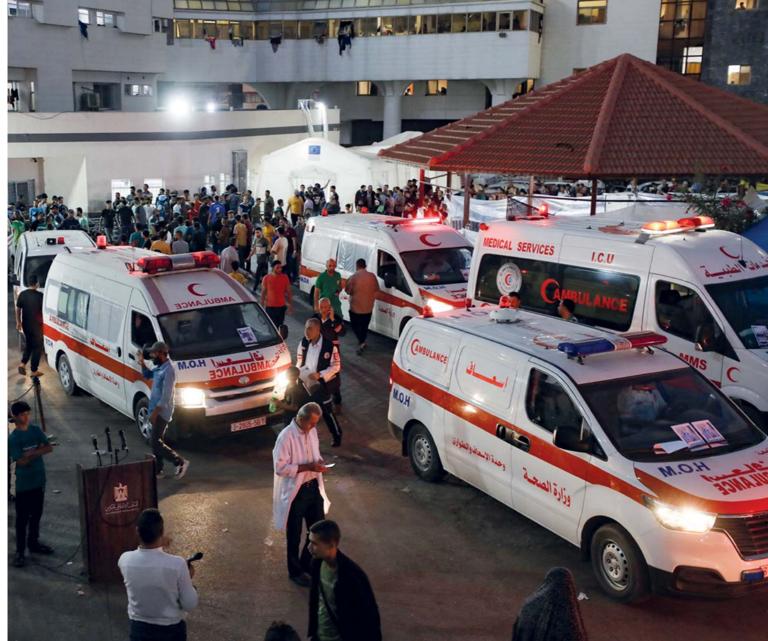
▼ Ambulances carrying victims of airstrikes crowd the entrance of Al-Shifa hospital in Gaza City, 15 October 2023.