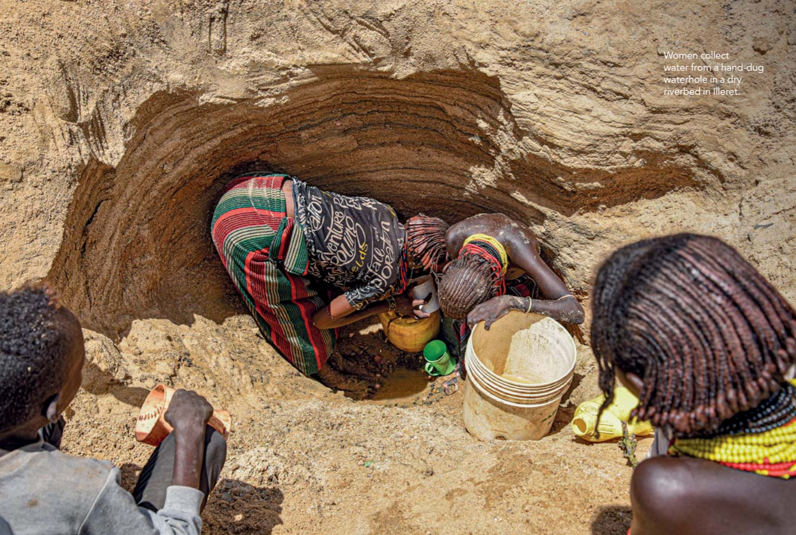
Women collect water from a hand-dug waterhole in a dry riverbed in Ileret.