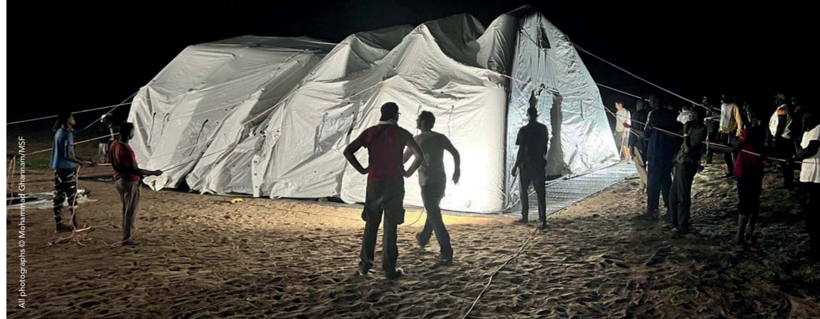
All photographs © Mohammad Ghannam/MSF