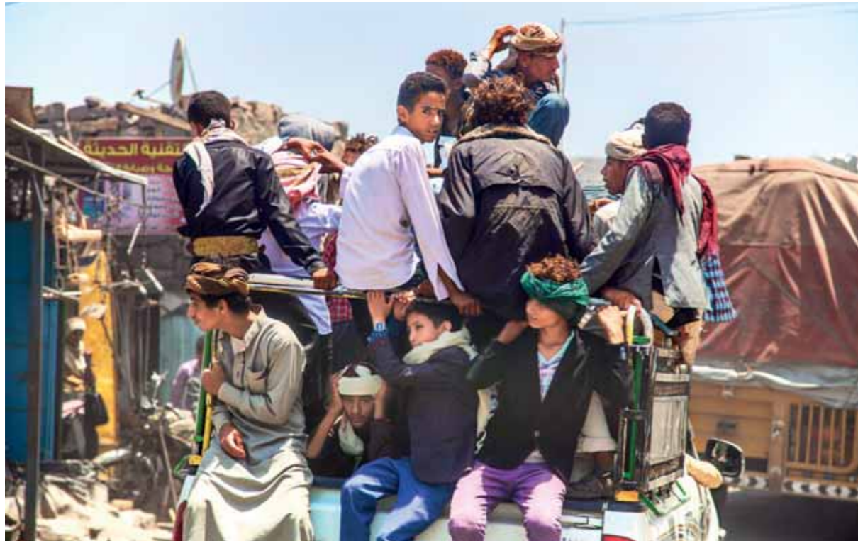
A group of boys ride on a vehicle in Hodeidah. Illustration © Isabella Sutton

The conflict in Yemen has now entered its sixth year.