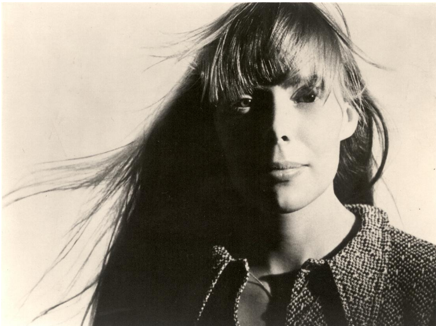
© Ed Thrasher - March 1968

Please send comments, corrections or additions to: simon@icu.com