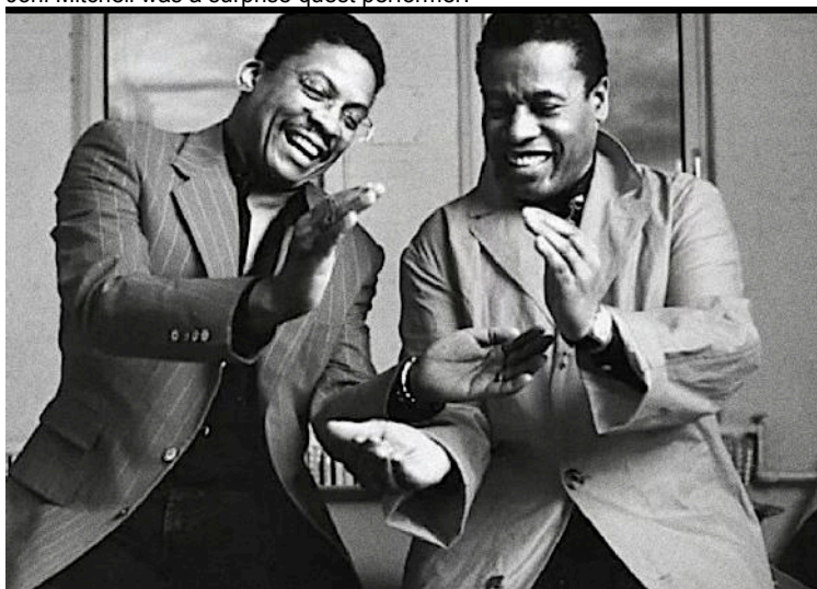
Herbie Hancock Celebrates Wayne Shorter

Joni Mitchell was a surprise quest performer.