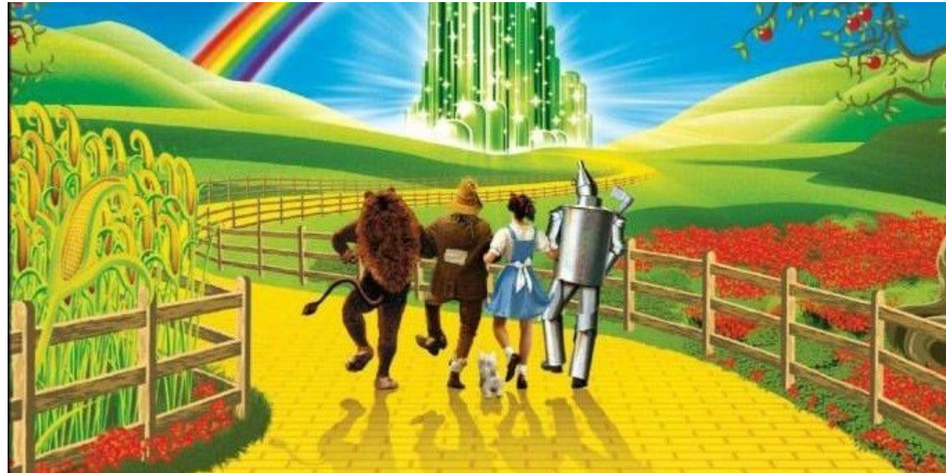
The yellow brick road, The Wizard of Oz by L. Frank Baum