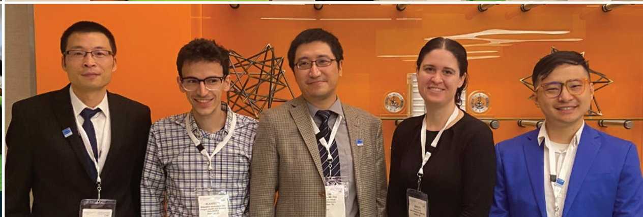
SNAPSHOTS OF 2021 | A Historical Year of Support and Impact for the CAP Foundation