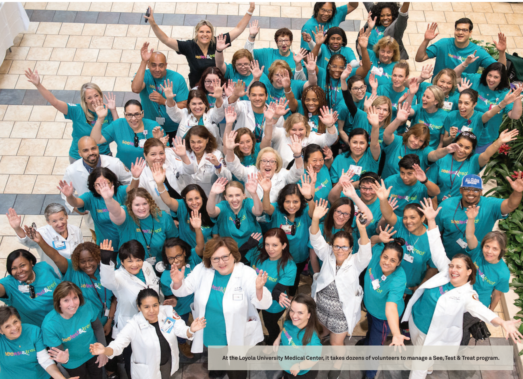
At the Loyola University Medical Center, it takes dozens of volunteers to manage a See, Test & Treat program.