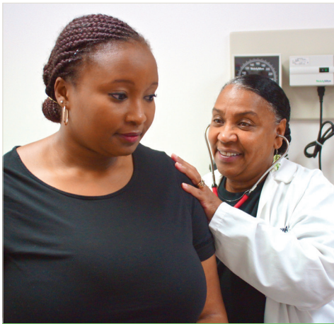
See, Test & Treat programs include a basic exam.

Pathologists, along with physicians from other specialties, nurses, and countless other volunteers, made a difference, once again. In 2018, the CAP Foundation's See, Test & Treat program provided free cancer screening for 728 women at locations around the country. Each program is managed by a lead pathologist (listed with the program summaries), with as many as 40 pathologists volunteering their assistance.