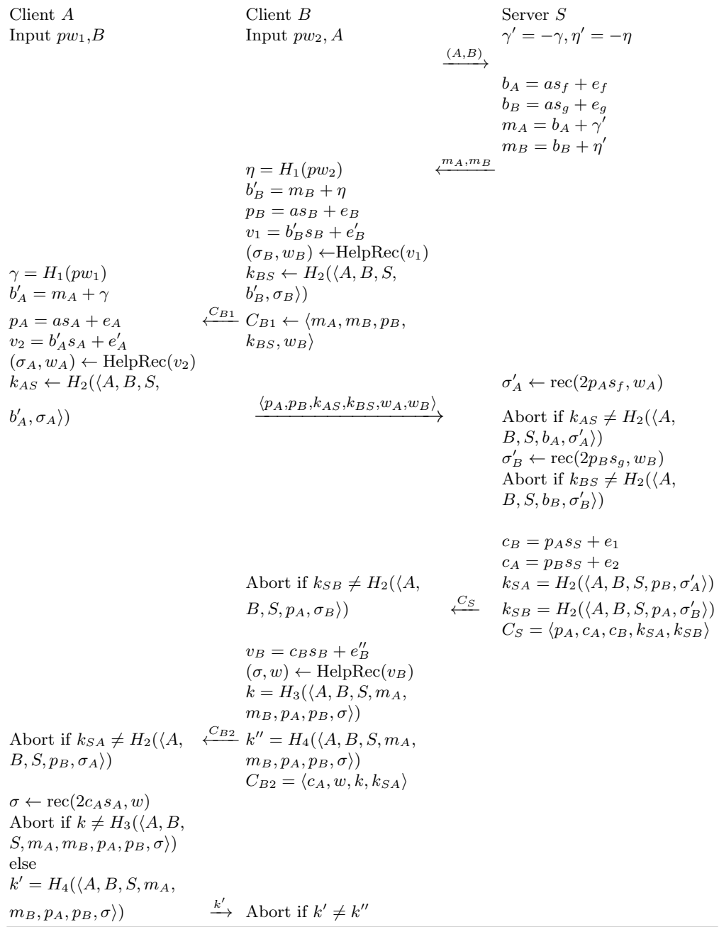
Fig. 1. Three-party password authenticated protocol: RLWE-3PAK, where s_S, e_S, s_f, e_f, s_g, e_g, s_B, e_B, e'_B, e''_B, e_A, e'_A, e_1, e_2 is sampled from \chi_\beta . Shared session key is sk = H_5(\langle A, B, S, m_A, m_B, p_A, p_B, \sigma \rangle) .