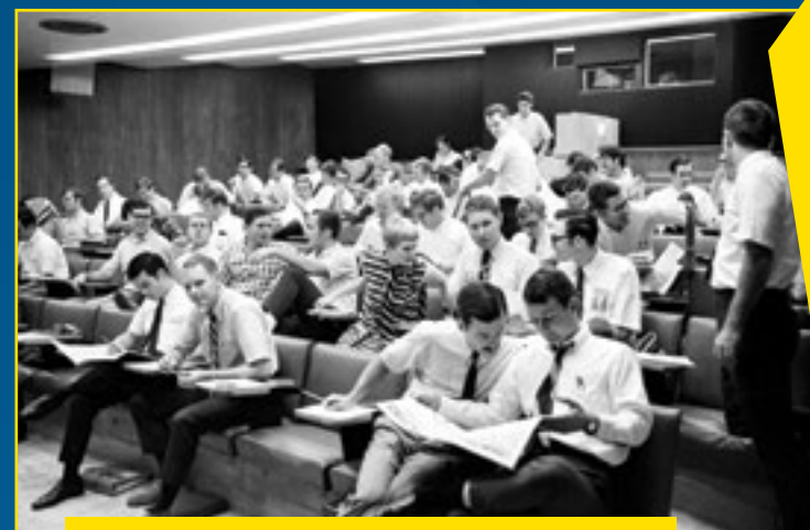
Class of 1971 - Settling in for their 8 AM lecture

1970s - The Apollonian Society is established