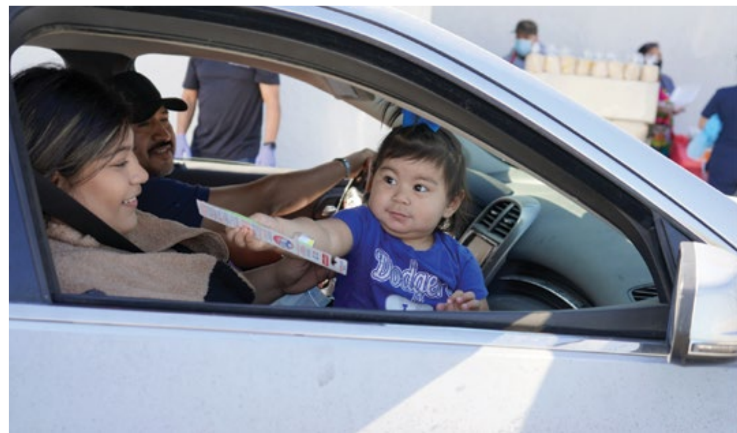
Below photo: A young Dodger’s fan is given a child’s toothbrush with her parents at a free oral health screening and outreach event.