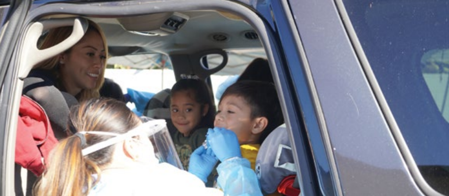
Above photo: A young child is given an oral health screening by a student dentist volunteer at the outreach event. Oral hygiene products and informational pamphlets were given to all of the attendees.

KCDC’s longstanding mission is to improve the oral health of children from low-income families in Burbank and other areas of need. The pediatric dentistry clinic is one of 15 affiliated sites that the UCLA School of Dentistry’s Community-Based Clinical Education Program collaborates with.