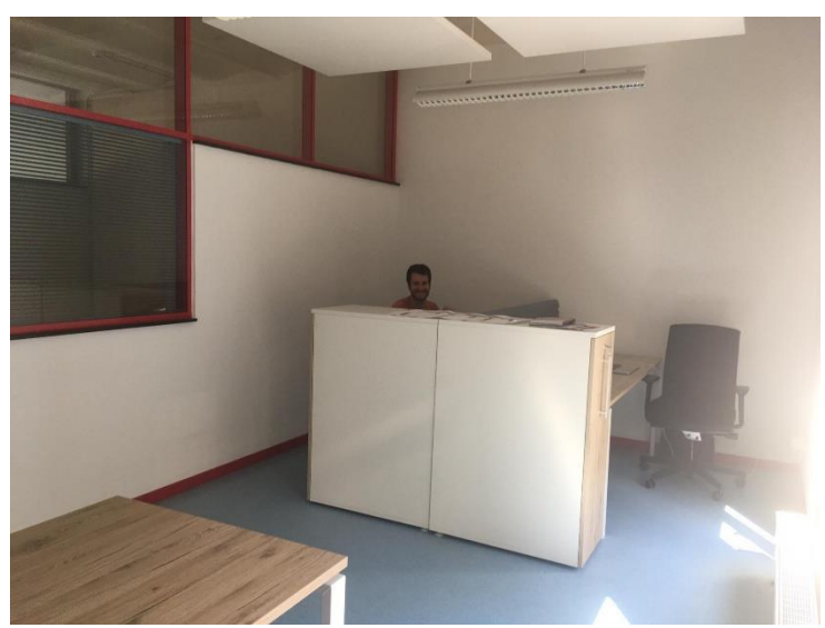
Figure 1.2 Photo of the CIVIS Representation Office

The Representation Office will be a valuable tool to facilitate the sharing of information within CIVIS, for building up a visibility as an essential actor of the "European Universities" landscape and for the coordination of the implementation of the CIVIS dissemination plan.