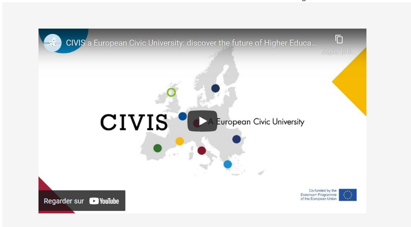
Figure 1.1 What is CIVIS?

This video presents CIVIS and its objective. It also explains the purpose of the Hubs which focus on five themes, namely Health; Cities, territories and mobilities; Digital and technological transformation; Climate, environment and energy; and, Society, culture and heritage.