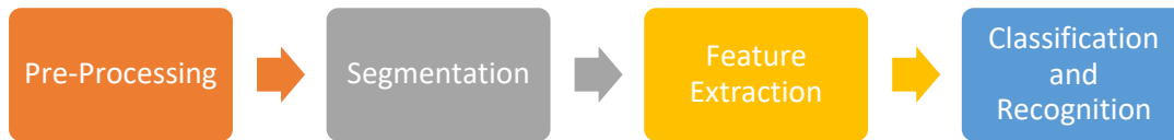
Figure 1: Classification and Recognition phases

character set. As tests extend, these clear arrangement procedures are sufficient to oblige the shape variability of tests as can't yield high affirmation precision. To misuse huge model data, the character affirmation neighborhood coordinated focus toward gathering strategies subject to acquiring from the model's framework especially fake neural associations from the last piece of the 1980s till 1990s. Learning strategies have benefitted character affirmation immensely by conveying the experts from the horrifying situation of organization disclosure and tuning and the affirmation accuracy has incited considering acquiring from colossal model data. Figure 1 shows the process of classification of characters and their recognition [5,6,7].