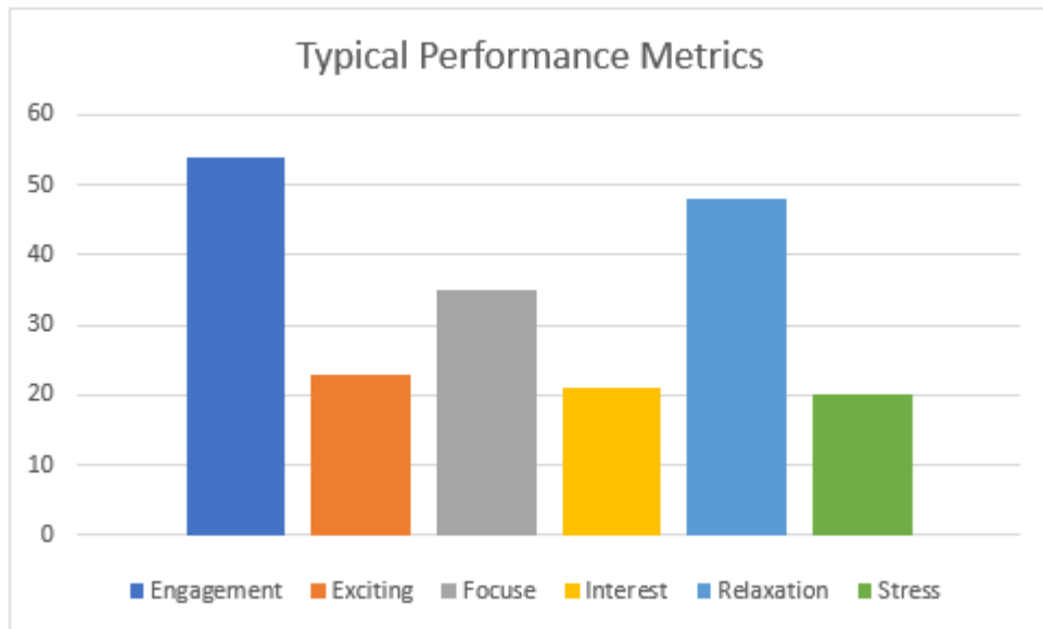
Figure 2: Typical Performance Metrics studied by Emotiv BCI analysis through routine activity 2 .

Control tests included attention, decision, workload, and emotional metrics. In improvised situations tested persons, who will more flexible, show the higher reaction in decision-making process then untrained. All these results you can find in the Figure 3 graph, based on Stroop test control. As stimuli in this training randomly colored words are used. Then the accuracy is dependent on correct detection of color confirmed by appropriate key pressing or by voice input. Possible absolute BCI can include a biosensual device for throat impulses sensing that allows to read and recognize appropriate lingual activity figures. Also, BCI can be combined with eye-blinking recognition. These directions should have special research and discussion [9].