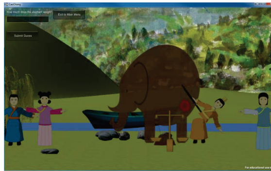
Fig. 2. Cao Chung Weighing an Elephant

When the boat was ready, the boy told a man to lead the elephant down into it. The elephant was very heavy, and the water came up very high along the boat's sides. Cao Chung made a mark along the water line. After that the man drove the elephant onto the bank. Cao Chung then told the men to put heavy stones into the boat until the water again came up to the line. Cao Chung then told the men to take the stones off the boat and weigh them one by one. He wrote down the weight of each stone and then added up all the weights. In this way he got the weight of the elephant.