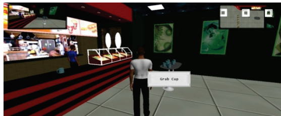
Fig. 4. School Café

Finally, we have created two 3D environments with 3D characters in them, as shown in Figures 4 and 5 below. One is a student café with realistic models of human characters. The other is a living room with children characters modeled in cartoon style. They were designed to attract users of different ages. In both environments, the users can control a character, “walk” around in the environment, talk with other characters, and interact with objects in the room. For example, in the café, the user can pick up a cup and hand it to a virtual characters or to another user. The user can also collaborate with another user and push the tables around.