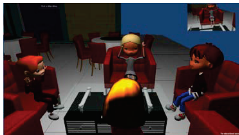
Fig. 5. Living Room