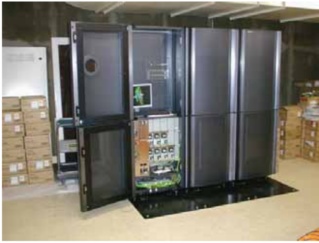
Figure 3: Sony SAIT PetaSite tape library. Seven tape drives, control PC, 16 port fibre channel switch are in the left most console. The left-most console holds 200 tapes (100TB). Each of the right two consoles hold 400 tapes (200TB).