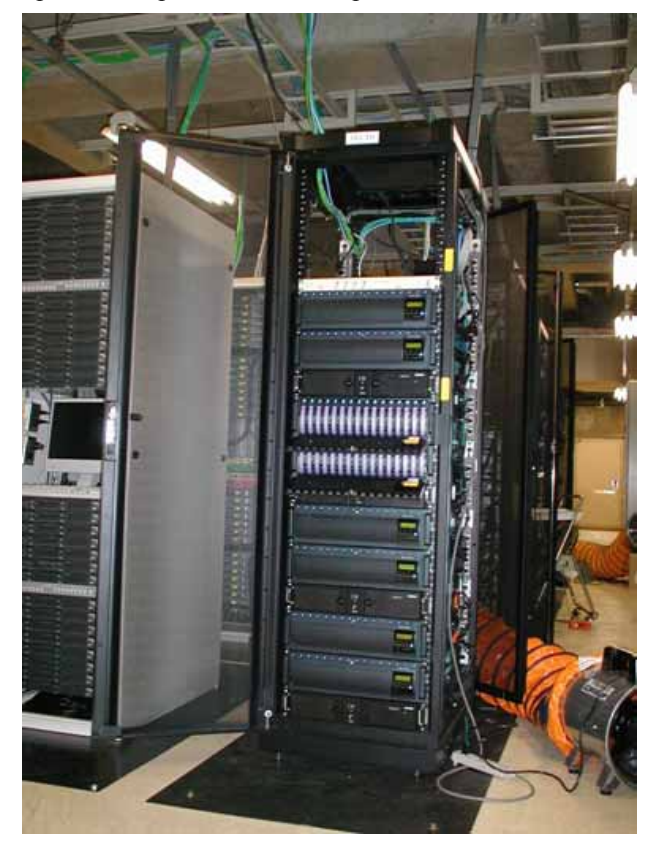
Figure 2: Four file servers with eight 16 300GB IDE RAID systems

SAIT introduces a tape-based data storage technology platform that in its first generation delivers the industry's highest capacity tape drive, storing up to 500GB of uncompressed data on a single-reel, half-inch tape cartridge and featuring a sustained native transfer rate of up to 30MB per second uncompressed.