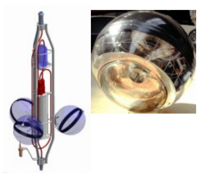
Figure 1. Left: A storey of a string with the three OMs supported by a titanium frame. The cylindrical container for the electronic components (bottom) and an optical beacon (top) are located inside the frame. Right: An optical module. The metal grid inside the sphere is a mu metal cage shielding the PMT against the Earth magnetic field.