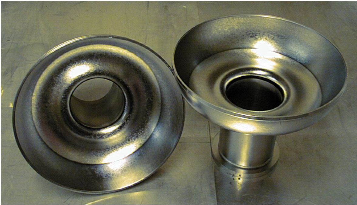
Fig. 2. 1300 MHz re-entrant cavity cups.

The change of the shape leads to some technological complications. Re-entrant cups were successfully formed, heat-treated and prepared to electropolishing and welding.