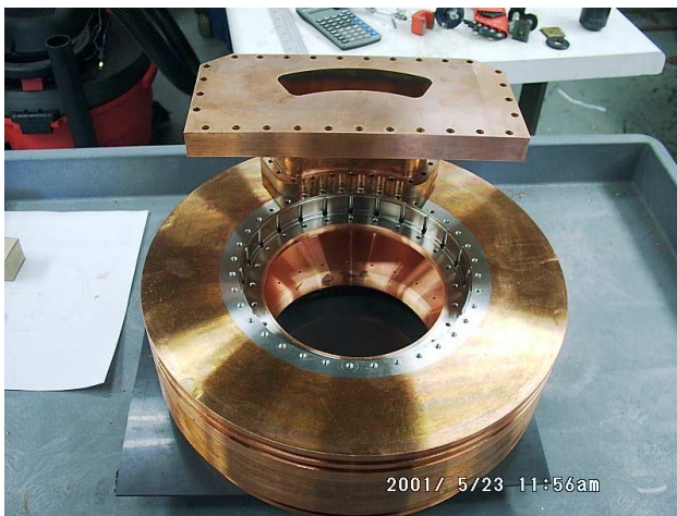
Figure 1. Be window high-power test cavity in fabrication.

An 805 MHz high-power test cavity has been designed to accept demountable 16 cm diameter Be foil windows for testing to high gradient in the Lab-G facility. Figure 1 shows the cavity during fabrication; the input power coupler, and the steel rings to which the Be windows will be mounted can be seen. Windows of different designs may be tested in this cavity, and we plan to experiment with foils of various thickness, variation of the thickness as a function of radius, different alloys, and anti-multipactor coatings. In the Lab-G facility we will be able to test conditioning and survivability of the larger foils at high gradient, and under various magnetic field configurations as expected in the cooling channel.