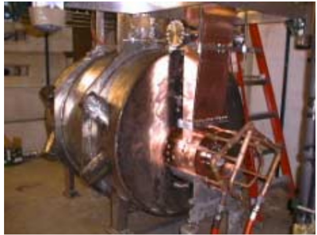
Figure 2. 6-cell open-cell structure installed in the superconducting magnet at the Lab G facility.